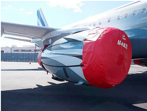
Airbus A319 Intake/Exhaust Covers set, IAE V2500

The Engine Inlet Plugs are custom fit for your Airbus A340 intakes, made with heavy-duty vinyl material, and stuffed with a single block of sculpted urethane foam. Each plug has a zipper that allows the foam to be removed and dried if necessary. Engine plugs have 'remove before flight' streamers sewn onto the face of the plugs. Most plugs are imprinted with the aircraft registration number in black for an extra charge. Storage bag NOT included. Engine plugs may be inserted after flight when the engine is still warm. Engine Inlet Plugs are commonly referred to as Cowl Plugs, Intake Plugs, Cowl Blocks, Engine Blocks, and Engine Bungs.