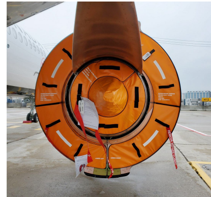
Airbus A320 Exhaust & Bypass Vent Plugs