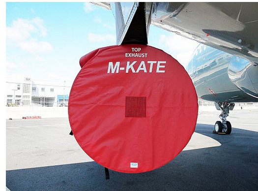
Airbus A319 Intake/Exhaust Covers set, IAE V2500