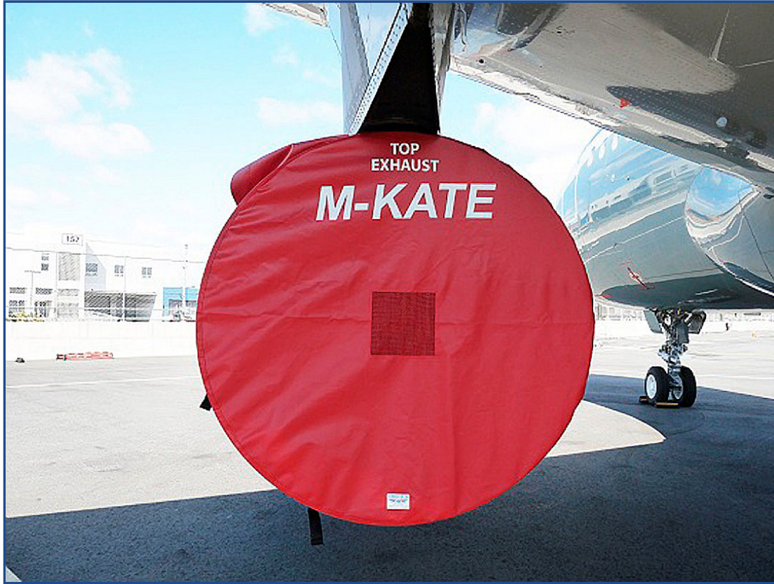
Airbus A319 Intake/Exhaust Covers set, IAE V2500