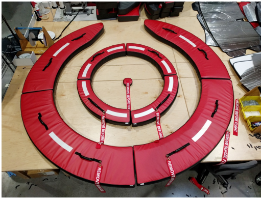
Boeing 747-8 Exhaust Plugs

The Engine Exhaust Plugs are custom fit for your Airbus A330, A350 exhaust openings, made with heavy-duty vinyl material, and stuffed with a single block of sculpted urethane foam. Each plug has a zipper that allows the foam to be removed and dried if necessary. Exhaust plugs have 'remove before flight' streamers sewn onto the face of the plugs. Most plugs are imprinted with the aircraft registration number in black for an extra charge. Exhaust plugs may be inserted soon after flight when the engine is still warm. Engine Inlet Plugs are commonly referred to as Cowl Plugs, Intake Plugs, Cowl Blocks, Engine Blocks, and Engine Bungs.