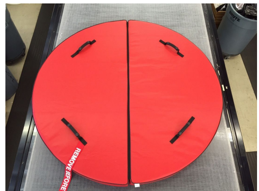
Boeing 737 Max Intake Plug, folding type