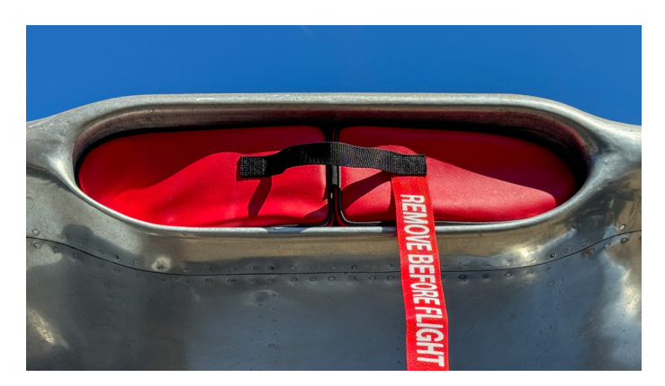
Douglas A26 Invader Oil Cooler Inlet Plugs

Mitchell B25 Cockpit Cover w/ Custom Imprint (Bellystrap Type)