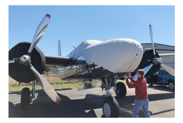
A-26 Invader Cockpit Cover (Illustration)