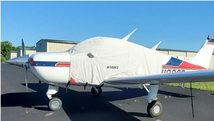
Beech C23 Sundowner Extended Canopy Cover