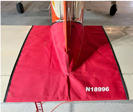
Beech C24R Tailcone Cover, fully enclosed

WINTER USE MATERIAL - Made with Solution-Dyed Polyester fabric, this option is intended for seasonal use to aid in deicing, rain mitigation, or for occasional travel. The material is lighter and more compact, but more susceptible to UV damage and may have a shorter useful life if used continuously outside than the all-year use material.