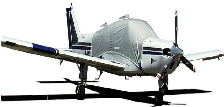
Beech Sport Canopy Cover

Travel Covers are made with Silver Solution-Dyed Polyester fabric and only lined over the windshield to save weight. The material is lightweight and more compact for easy stowage in the aircraft. The polyester material is water resistant, but only intended for occasional use outside. We also have an ultra lightweight material available for fitted hangar dust covers. For daily outdoor use, the non-travel Sunbrella Cover is the best choice.