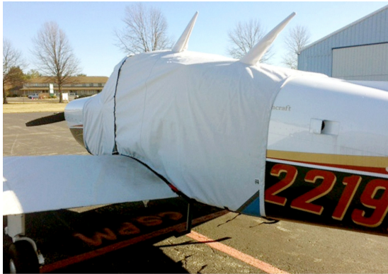
Beech Sundowner Extended Canopy Cover, Belly Strap Type

This cover type is made from Silver Acrylic Sunbrella canvas and is 100% lined with a soft and smooth microfiber. Bruce's Custom Covers developed this material combination especially for aircraft protection. The outer material is medium weight and treated for water resistance, UV resistance and anti-static buildup. The inner lining is a very soft and smooth microfiber to prevent scratching. The material is very reflective, and tests show that the cabin interior temperature can be reduced to near-ambient temperature on the hottest of days. It is water, ice and snow repellent, yet breathable to allow moisture to escape from between the cover and the aircraft surface.