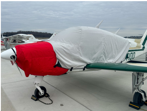
Beech A24R Insulated Engine Cover, fully enclosed