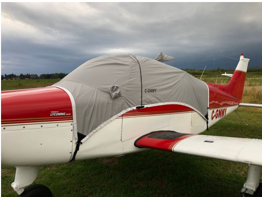
Beech Sundowner Travel Canopy Cover