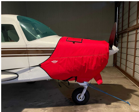
Beech Musketeer Insulated Engine Covers

This cover type is made from Silver Acrylic Sunbrella canvas and is 100% lined with a soft and smooth microfiber. Bruce's Custom Covers developed this material combination especially for aircraft protection. The outer material is medium weight and treated for water resistance, UV resistance and anti-static buildup. The inner lining is a very soft and smooth microfiber to prevent scratching. The material is very reflective, and tests show that the cabin interior temperature can be reduced to near-ambient temperature on the hottest of days. It is water, ice and snow repellent, yet breathable to allow moisture to escape from between the cover and the aircraft surface.