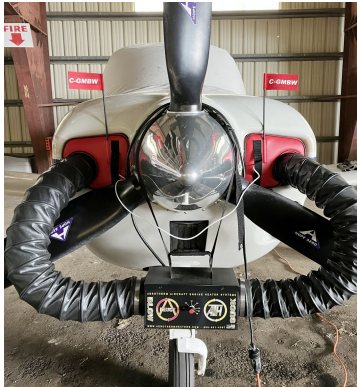
Beech Sierra Engine Inlet Plugs w/ Aerotherm Heater Openings