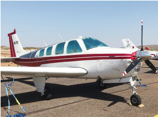
Beech A-36 Bonanza Cabin HeatShields