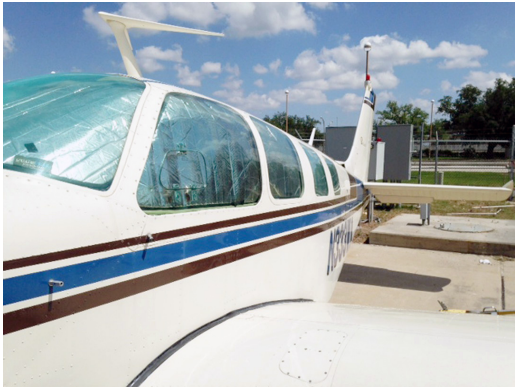
Beech Bonanza HeatShields

Windshield Heatshields are interior sunshades for an aircraft's front windshield. The product is a unique composite of closed-cell foam with a silver mylar finish. The semi-rigid design is stiff enough to stand along the inside of the windshield using sun visors or window framing. It folds up flat and easily stores in the included storage sleeve. Some designs may require velcro and suction cups or split right and left sides. A Heatshield is an excellent short-term remedy for cockpit overheating. An external fabric cover is far more effective and practical for long-term protection.