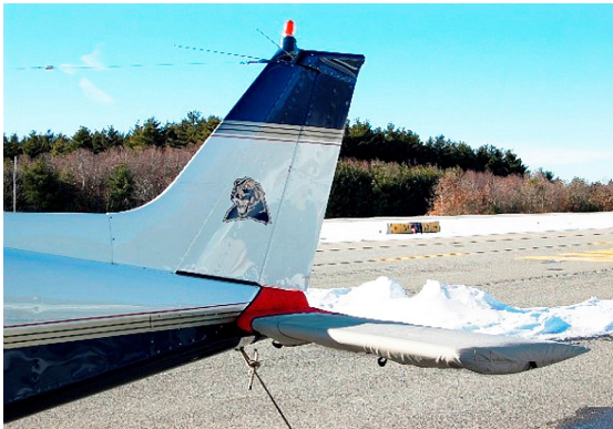
Tailcone & Horizontal Stabilizer Covers