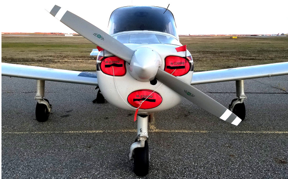
Beech Musketeer Engine Inlet Plugs

plugs have warning flags that are visible from the cockpit or 'remove before flight' streamers sewn onto the face of the plugs. Most plugs are imprinted with the aircraft registration number in black for an extra charge. Storage bag NOT included. Engine plugs may be inserted after flight when the engine is still warm. Engine Inlet Plugs are commonly referred to as Cowl Plugs, Intake Plugs, Cowl Blocks, Engine Blocks, and Engine Bungs.