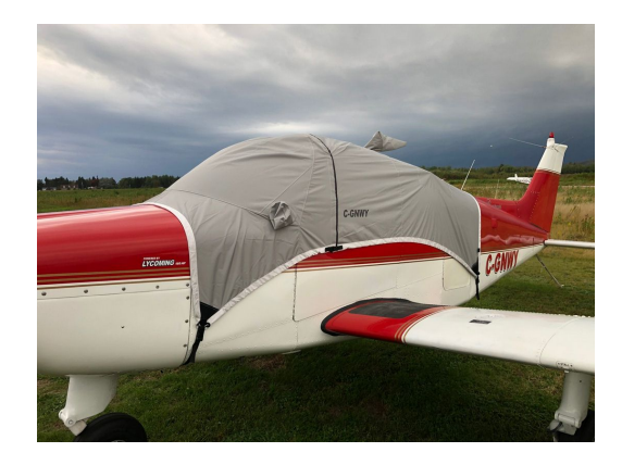
Beech Sundowner Travel Canopy Cover

Travel Covers are made with Silver Solution-Dyed Polyester fabric and only lined over the windshield to save weight. The material is lightweight and more compact for easy stowage in the aircraft. The polyester material is water resistant, but only intended for occasional use outside. We also have an ultra lightweight material available for fitted hangar dust covers. For daily outdoor use, the non-travel Sunbrella Cover is the best choice.