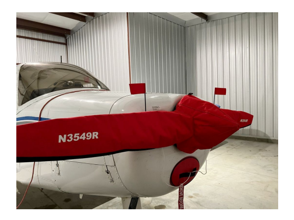
Beech A23 Musketeer Insulated Prop Cover, Engine Plugs

Engine Inlet Plugs are custom fit for your Beech Sport A19 intakes, made with heavy-duty vinyl material, and stuffed with a single block of sculpted urethane foam. Each plug has a zipper that allows the foam to be removed and dried if necessary. Engine plugs have warning flags that are visible from the cockpit or 'remove before flight' streamers sewn onto the face of the plugs. Most plugs are imprinted with the aircraft registration number in black for an extra charge. Storage bag NOT included. Engine plugs may be inserted after flight when the engine is still warm. Engine Inlet Plugs are commonly referred to as Cowl Plugs, Intake Plugs, Cowl Blocks, Engine Blocks, and Engine Bungs.