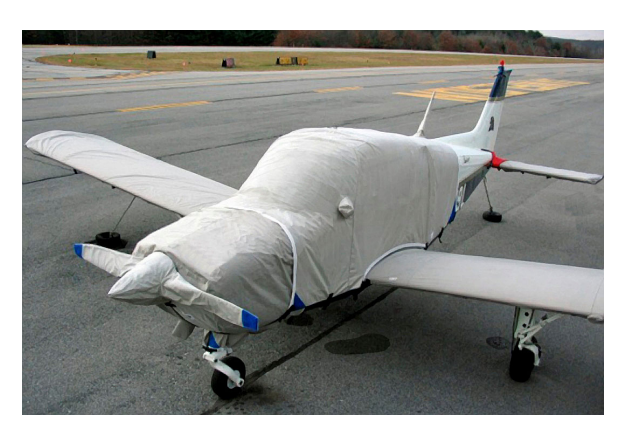
Beech Musketeer Tailcone Cover (Fully Enclosed) Beech Sierra Extended Canopy, Engine, Prop, Wings, Stab & Tailcone Covers