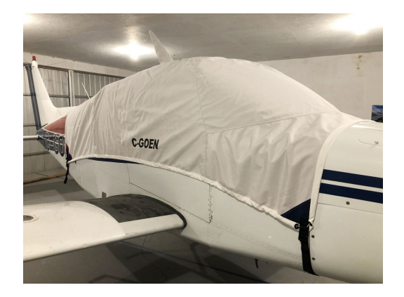
Beech Sierra B24R Canopy Cover

This cover type is made from Silver Acrylic Sunbrella canvas and is 100% lined with a soft and smooth microfiber. Bruce's Custom Covers developed this material combination especially for aircraft protection. The outer material is medium weight and treated for water resistance, UV resistance and anti-static buildup. The inner lining is a very soft and smooth microfiber to prevent scratching. The material is very reflective, and tests show that the cabin interior temperature can be reduced to near-ambient temperature on the hottest of days. It is water, ice and snow repellent, yet breathable to allow moisture to escape from between the cover and the aircraft surface.