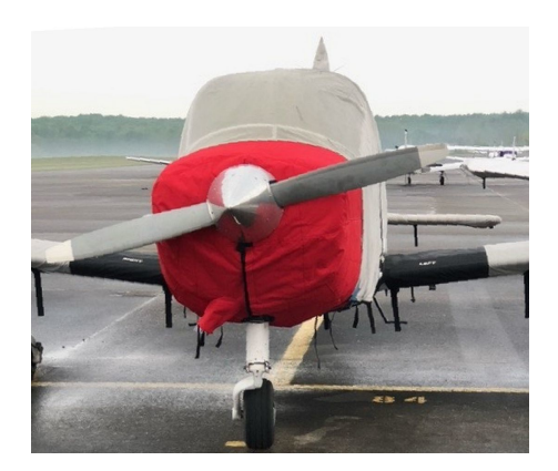
Beech Sierra Insulated Engine Cover

This cover type is made from Silver Acrylic Sunbrella canvas and is 100% lined with a soft and smooth microfiber. Bruce's Custom Covers developed this material combination especially for aircraft protection. The outer material is medium weight and treated for water resistance, UV resistance and anti-static buildup. The inner lining is a very soft and smooth microfiber to prevent scratching. The material is very reflective, and tests show that the cabin interior temperature can be reduced to near-ambient temperature on the hottest of days. It is water, ice and snow repellent, yet breathable to allow moisture to escape from between the cover and the aircraft surface.