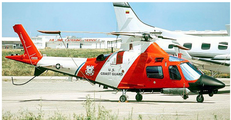
Covers, Plugs, HeatShields and related items for the Agusta MH-68A