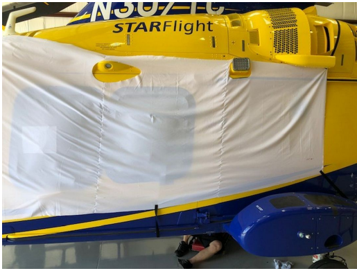
Leonardo (Agusta) A-169 Bubble Cover, test fit cover