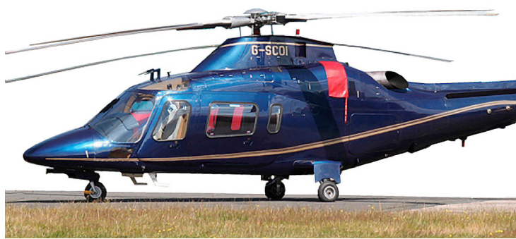
Agusta Power Intake Cover

WINTER USE MATERIAL - Made with Solution-Dyed Polyester fabric, this option is intended for seasonal use to aid in deicing, rain mitigation, or for occasional travel. The material is lighter and more compact, but more susceptible to UV damage and may have a shorter useful life if used continuously outside than the all-year use material.