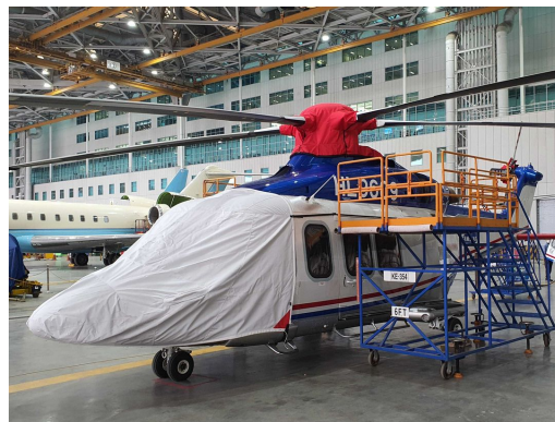
Agusta AW139 Cockpit/Nose, Rotor Mast Cover