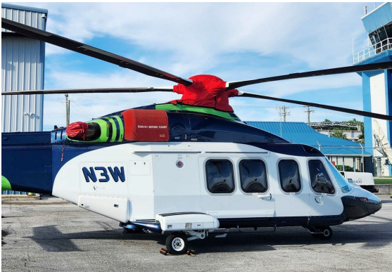
Agusta AW139 Rotor Mast Cover, covers upper deck & aft of rotor mast area

WINTER USE MATERIAL - Made with Solution-Dyed Polyester fabric, this option is intended for seasonal use to aid in deicing, rain mitigation, or for occasional travel. The material is lighter and more compact, but more susceptible to UV damage and may have a shorter useful life if used continuously outside than the all-year use material.