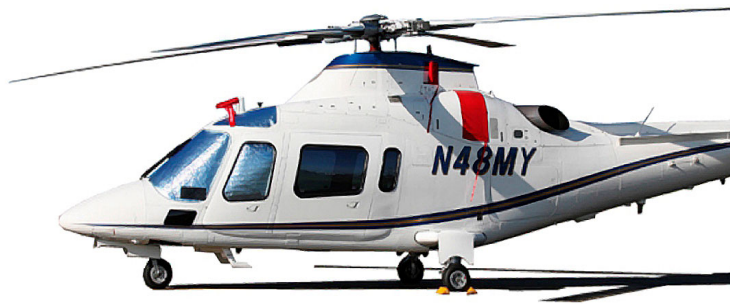
Agusta Power Pitot Covers, Intake Covers, and Cockpit Heatshield set

The Engine Exhaust Plugs are custom fit for your Agusta AW139, AW189 exhaust openings, made with heavy-duty vinyl material, and stuffed with a single block of sculpted urethane foam. Exhaust plugs have 'Remove Before Flight' streamers sewn onto the face of the plugs. Exhaust plugs may be inserted soon after flight when the engine is still warm. Engine Inlet Plugs are commonly referred to as Cowl Plugs, Intake Plugs, Cowl Blocks, Engine Blocks, and Engine Bungs.