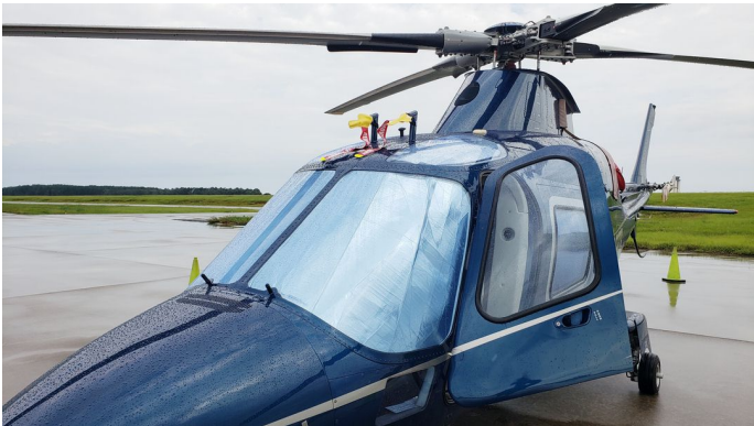
Agusta AW109S/SP Grand Heatshield Set

Heatshields are interior sunshades for an aircraft's windows or canopy glass. The product is a unique composite of closed-cell foam with a silver mylar finish. The semi-rigid design is stiff enough to stand along the inside of the windshield using sun visors or window framing. It folds up flat and easily stores in the included storage sleeve. Some designs may require velcro and suction cups. A Heatshield is an excellent short-term remedy for cockpit overheating.