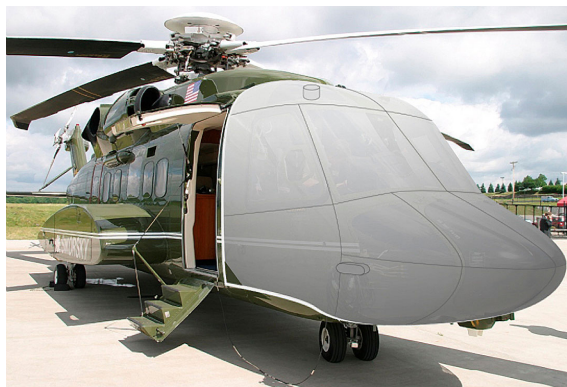
Sikorsky S-92 Windshield/Nose Cover (illustration)

This cover type is made from Silver Acrylic Sunbrella canvas and is 100% lined with a soft and smooth microfiber. Bruce's Custom Covers developed this material combination especially for aircraft protection. The outer material is medium weight and treated for water resistance, UV resistance and anti-static buildup. The inner lining is a very soft and smooth microfiber to prevent scratching. The material is very reflective, and tests show that the cabin interior temperature can be reduced to near-ambient temperature on the hottest of days. It is water, ice and snow repellent, yet breathable to allow moisture to escape from between the cover and the aircraft surface.