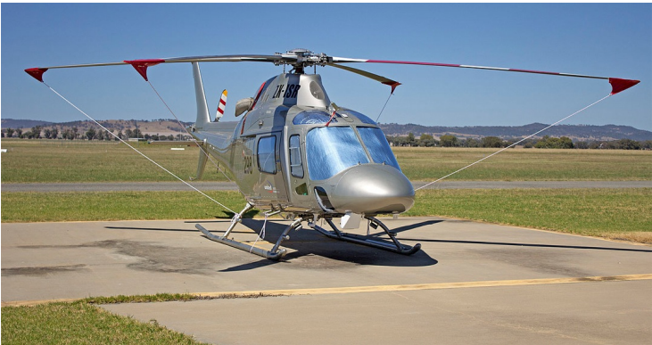
Agusta 119 Cockpit/Cabin HeatShields