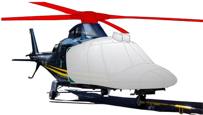
Agusta 109 Bubble, Rotor Hub & Blade Covers (illustration)