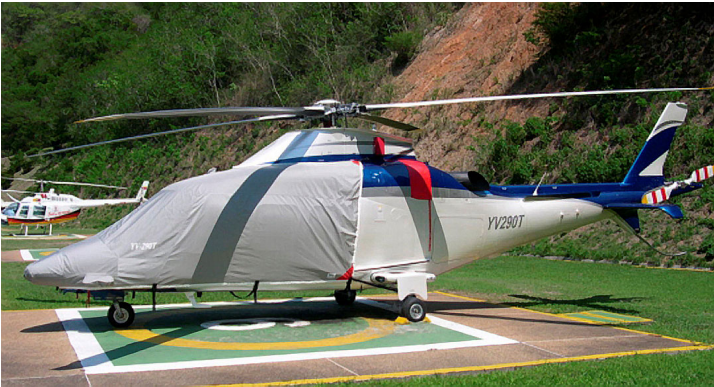
Agusta Grand Bubble Cover

Travel Covers are made with Silver Solution-Dyed Polyester fabric and fully lined over the entire cover. The material is lightweight and more compact for easy stowage in the aircraft. The polyester material is water resistant, but only intended for occasional use outside. We also have an ultra lightweight material available for fitted hangar dust covers. For daily outdoor use, the non-travel Sunbrella Cover is the best choice.