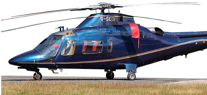
Agusta Power Intake Cover

WINTER USE MATERIAL - Made with Solution-Dyed Polyester fabric, this option is intended for seasonal use to aid in deicing, rain mitigation, or for occasional travel. The material is lighter and more compact, but more susceptible to UV damage and may have a shorter useful life if used continuously outside than the all-year use material.