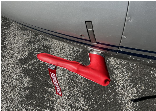
Agusta AW109 (A, C, & Trekker) Pitot Cover Set