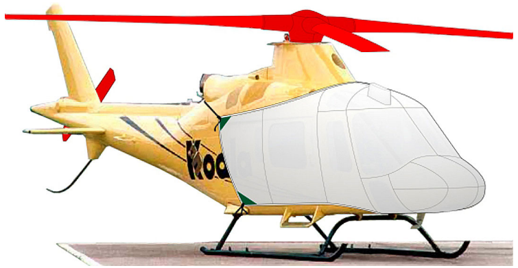
Koala Bubble, Rotor Hub, Blade & Tail Rotor Covers (illustration)