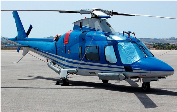
Agusta Power Cockpit HeatShields & Blade Tie-downs

Cabin Heatshields are interior sunshades for the aircraft's passenger cabin area. The product is a unique composite of closed-cell foam with a silver mylar finish. The semi-rigid design is stiff enough to stand inside the window framing. The set folds up flat and is easily stored in the included storage sleeve. Some designs may require velcro and suction cups. A Heatshield is an excellent short-term remedy for cockpit overheating, but an external fabric cover is more effective for long-term protection.