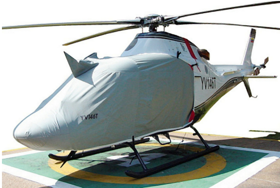
Koala Bubble Cover (with Wire Strike)