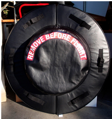
A-10 Exhaust Plug/Cover