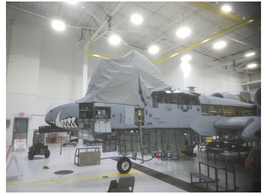
Fairchild A10 Thunderbolt Canopy Cover, Nose Gun Cover, Gun Scoop Inlet Plug Fairchild A-10 Canopy Cover, open position