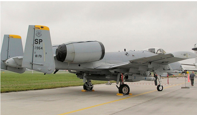
A-10 Engine Covers

ALL-YEAR USE MATERIAL - Made with Solution dyed Polyester fabric, the all-year use material is the best option for sun protection and cover longevity. This heavier more durable material is intended for all weather conditions, such as rain and snow or lots of sun.