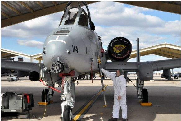
Fairchild A10 Intake Covers & Nose Gun Scoop Plug