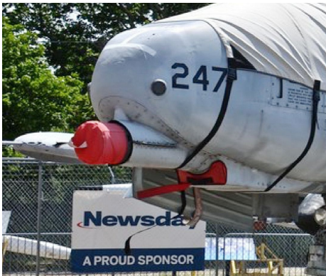
Fairchild A10 Thunderbolt Nose Gun Cover, Gun Scoop Inlet Plug

The Engine Inlet Plugs are custom fit for your Fairchild A10 Thunderbolt intakes, made with heavy-duty vinyl material, and stuffed with a single block of sculpted urethane foam. Each plug has a zipper that allows the foam to be removed and dried if necessary. Engine plugs have 'remove before flight' streamers sewn onto the face of the plugs. Most plugs are imprinted with the aircraft registration number in black for an extra charge. Storage bag NOT included. Engine plugs may be inserted after flight when the engine is still warm. Engine Inlet Plugs are commonly referred to as Cowl Plugs, Intake Plugs, Cowl Blocks, Engine Blocks, and Engine Bungs.