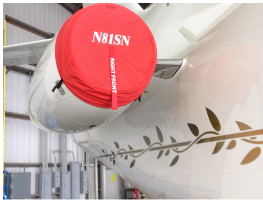
Falcon 900EX Intake Cover