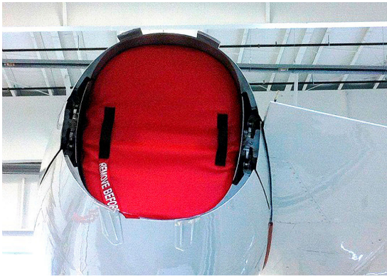
Falcon 2000EX Exhaust Plug