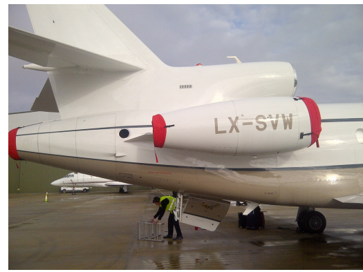
Falcon 900EX Engine Covers