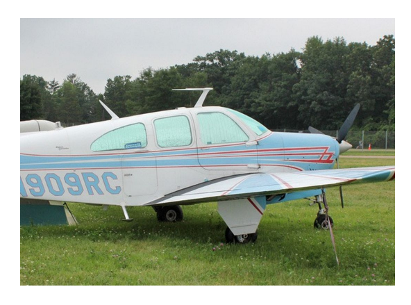
Beech Bonanza/Debonair HeatShield Set