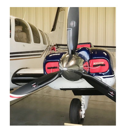
Beech Baron 58 Engine Inlet Plugs & Cowl Top Plug