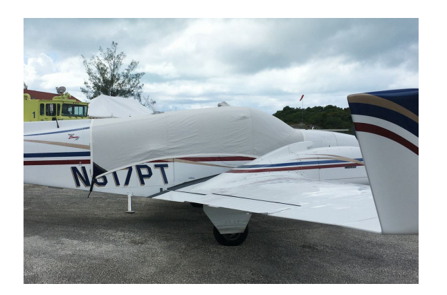
Beech Baron 58 Canopy Cover