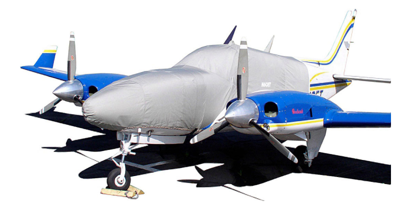
Baron Canopy/Nose Cover

Travel Covers are made with Silver Solution-Dyed Polyester fabric and only lined over the windshield to save weight. The material is lightweight and more compact for easy stowage in the aircraft. The polyester material is water resistant, but only intended for occasional use outside. We also have an ultra lightweight material available for fitted hangar dust covers. For daily outdoor use, the non-travel Sunbrella Cover is the best choice.