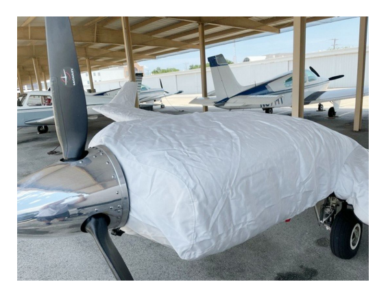
Beech Baron 58P Wing/Engine Covers (test fit)