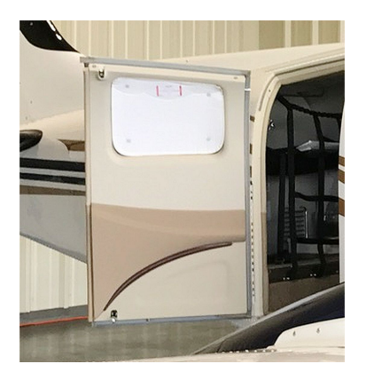
Beech Baron 58 Cabin HeatShield