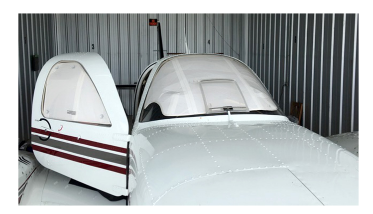
Beech Baron 58P Cockpit Heatshield Set

Heatshields are interior sunshades for an aircraft's windows or canopy glass. The product is a unique composite of closed-cell foam with a silver mylar finish. The semi-rigid design is stiff enough to stand along the inside of the windshield using sun visors or window framing. It folds up flat and easily stores in the included storage sleeve. Some designs may require velcro and suction cups. A Heatshield is an excellent short-term remedy for cockpit overheating.