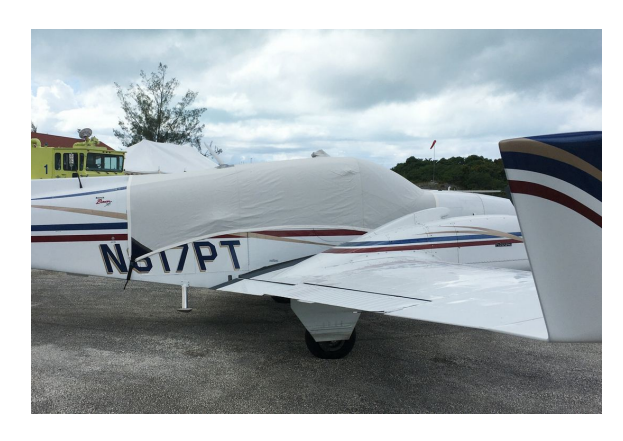
Beech Baron 58 Canopy Cover