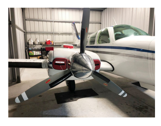
Beech Baron Engine Plugs