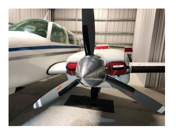
Beech Baron Engine Plugs