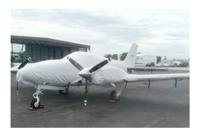
Full Cover Set (58P-020, 58P-225, 58P-405)

WINTER USE MATERIAL - Made with Solution-Dyed Polyester fabric, this option is intended for seasonal use to aid in deicing, rain mitigation, or for occasional travel. The material is lighter and more compact, but more susceptible to UV damage and may have a shorter useful life if used continuously outside than the all-year use material.