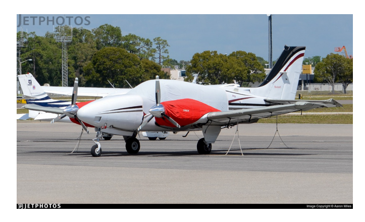
Beech Baron 58, G58 Canopy Cover, Insulated Engine Covers