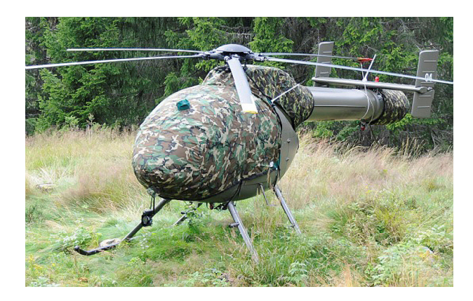
MD520 NOTAR Bubble, Engine, & NOTAR Covers & Blade Tiedowns