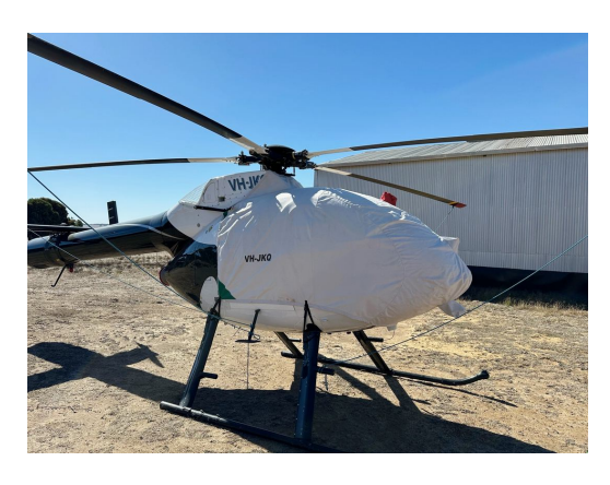
MDD 520 NOTAR Bubble Cover w/Intake Cover Add-On