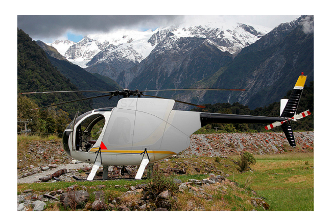
Engine Cover (illustration)