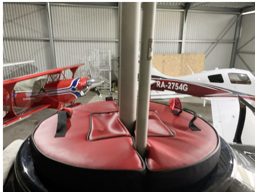
Bell 505 Jet Ranger X Swash Plate Plug

The Engine Inlet Plugs are custom fit for your Bell 505 Jet Ranger X intakes, made with heavy-duty vinyl material, and stuffed with a single block of sculpted urethane foam. Each plug has a zipper that allows the foam to be removed and dried if necessary. Engine plugs have 'Remove Before Flight' streamers sewn onto the face of the plugs. Most plugs are imprinted with the aircraft registration number in black for an extra charge. Storage bag NOT included. Engine plugs may be inserted after flight when the engine is still warm. Engine Inlet Plugs are commonly referred to as Cowl Plugs, Intake Plugs, Cowl Blocks, Engine Blocks, and Engine Bungs.