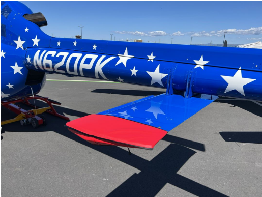
Bell 505 Horizontal Stabilizer Tip Pads