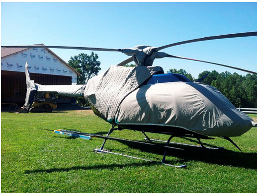
Bell 407 Covers: Bubble, Insulated Engine, Rotor Mast, Blades, Tailboom, Vertical Stabilizer and Tail Rotor