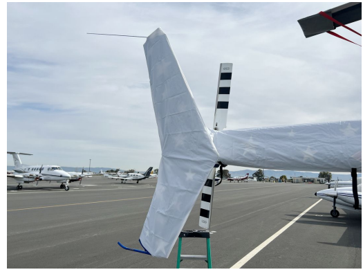
Bell 505 Tailboom & Stabilizer Covers, test fit cover