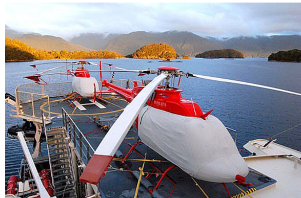
Bell 407 Bubble Cover