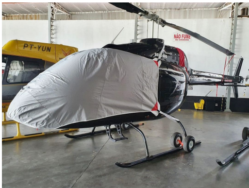
Bell 505 Travel Weight Bubble Cover

Travel Covers are made with Silver Solution-Dyed Polyester fabric and fully lined over the entire cover. The material is lightweight and more compact for easy storage in the aircraft. The polyester material is water resistant, but only intended for occasional use outside. We also have an ultra lightweight material available for fitted hangar dust covers. For daily outdoor use, the non-travel Sunbrella Cover is the best choice.