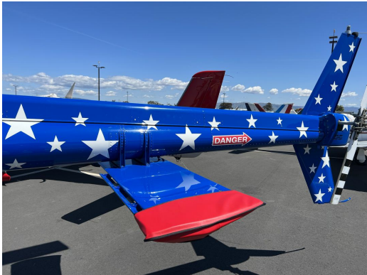
Bell 505 Horizontal Stabilizer Tip Pads

Designed to prevent damage to the aircraft extremities in crowded hangars, these products are made of bright red Naugahyde and thickly padded with a sandwich of closed cell foam.