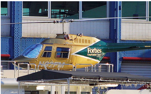
Bell 206B Jetranger Windshield HeatShields

Heatshields are interior sunshades for an aircraft's windows or canopy glass. The product is a unique composite of closed-cell foam with a silver mylar finish. The semi-rigid design is stiff enough to stand along the inside of the windshield using sun visors or window framing. It folds up flat and easily stores in the included storage sleeve. Some designs may require velcro and suction cups. A Heatshield is an excellent short-term remedy for cockpit overheating.