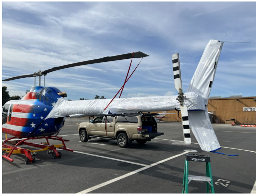
Bell 505 Tailboom & Stabilizer Covers, test fit cover