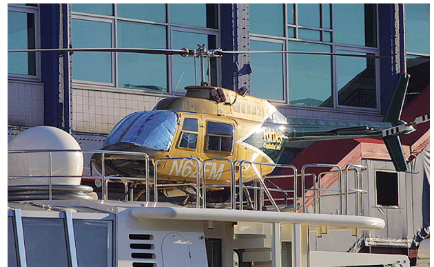
Bell 206B Jetranger Windshield HeatShields