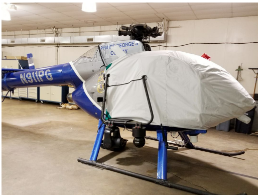
McDonnell Douglas MDD 520 Notar Bubble Cover, with special missions equipment.

Travel Covers are made with Silver Solution-Dyed Polyester fabric and fully lined over the entire cover. The material is lightweight and more compact for easy stowage in the aircraft. The polyester material is water resistant, but only intended for occasional use outside. We also have an ultra lightweight material available for fitted hangar dust covers. For daily outdoor use, the non-travel Sunbrella Cover is the best choice.