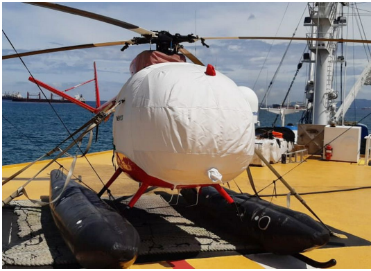
Hughes 500C (369HS) Bubble Cover