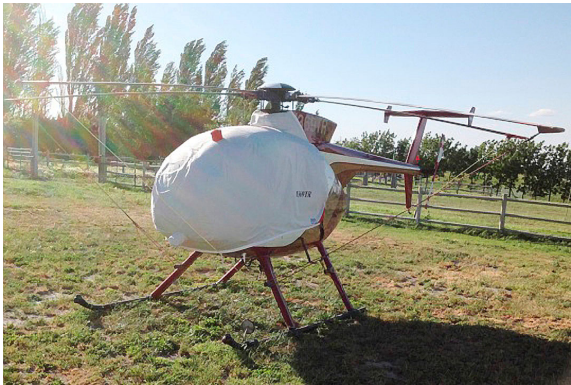
MD500D Bubble Cover with Intake Add-On

Travel Covers are made with Silver Solution-Dyed Polyester fabric and fully lined over the entire cover. The material is lightweight and more compact for easy stowage in the aircraft. The polyester material is water resistant, but only intended for occasional use outside. We also have an ultra lightweight material available for fitted hangar dust covers. For daily outdoor use, the non-travel Sunbrella Cover is the best choice.