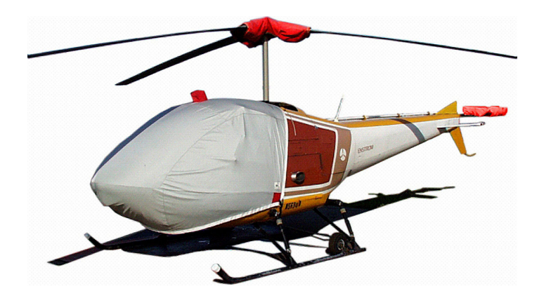
Enstrom 280FX Bubble, Main Rotor Mast, Tail Rotor Covers on Enstrom F280FX