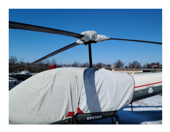
Enstrom 280C Shark Bubble, Engine & Rotor Hub Covers

WINTER USE MATERIAL - Made with Solution-Dyed Polyester fabric, this option is intended for seasonal use to aid in deicing, rain mitigation, or for occasional travel. The material is lighter and more compact, but more susceptible to UV damage and may have a shorter useful life if used continuously outside than the all-year use material.