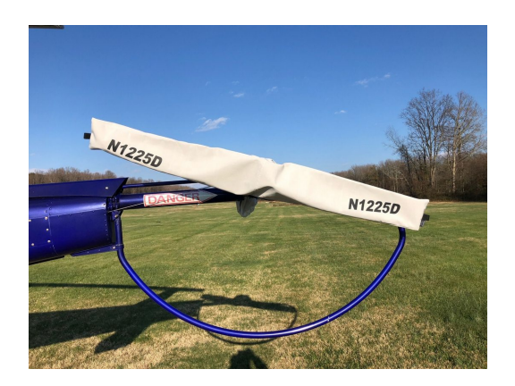
Enstrom F280FX Tail Rotor Cover