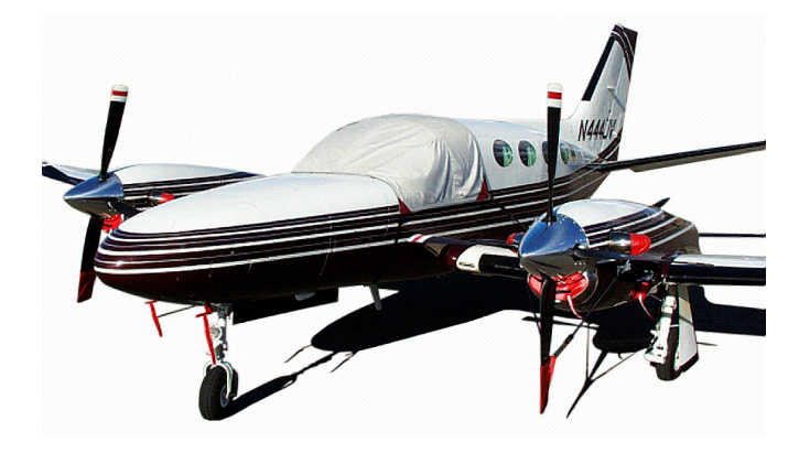
Cessna 425 Cockpit Cover

Travel Covers are made with Silver Solution-Dyed Polyester fabric and only lined over the windshield to save weight. The material is lightweight and more compact for easy stowage in the aircraft. The polyester material is water resistant, but only intended for occasional use outside. We also have an ultra lightweight material available for fitted hangar dust covers. For daily outdoor use, the non-travel Sunbrella Cover is the best choice.