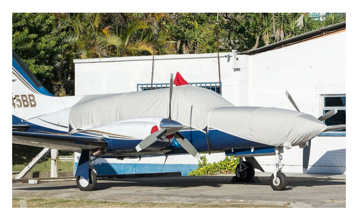
Cessna 421 Canopy Cover & Nose Cover

Covers developed this material combination especially for aircraft protection. The outer material is medium weight and treated for water resistance, UV resistance and anti-static buildup. The inner lining is a very soft and smooth microfiber to prevent scratching. The material is very reflective, and tests show that the cabin interior temperature can be reduced to near-ambient temperature on the hottest of days. It is water, ice and snow repellent, yet breathable to allow moisture to escape from between the cover and the aircraft surface.