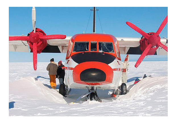
Casa 212 Insulated Engine & Propellor/Spinner Covers

This cover type is made from Silver Acrylic Sunbrella canvas and is 100% lined with a soft and smooth microfiber. Bruce's Custom Covers developed this material combination especially for aircraft protection. The outer material is medium weight and treated for water resistance, UV resistance and anti-static buildup. The inner lining is a very soft and smooth microfiber to prevent scratching. The material is very reflective, and tests show that the cabin interior temperature can be reduced to near-ambient temperature on the hottest of days. It is water, ice and snow repellent, yet breathable to allow moisture to escape from between the cover and the aircraft surface.