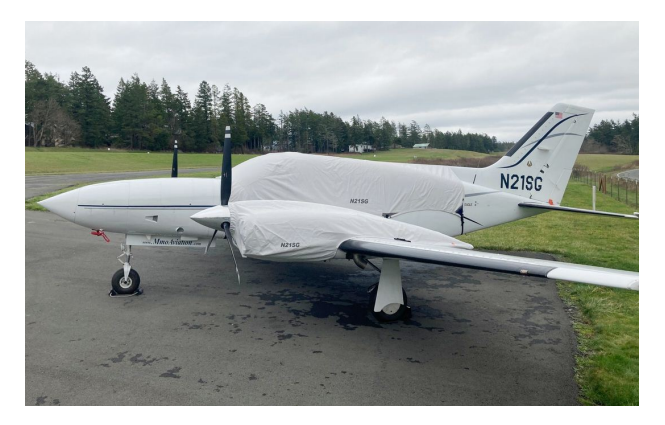
Cessna 421C Canopy & Engine Covers