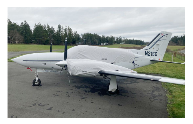
Cessna 421C Canopy & Engine Covers