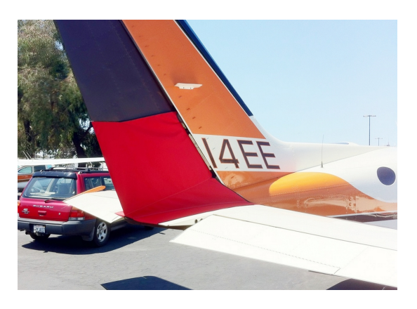
Cessna 414 Rudder Openings Cover (bird barrier)

WINTER USE MATERIAL - Made with Solution-Dyed Polyester fabric, this option is intended for seasonal use to aid in deicing, rain mitigation, or for occasional travel. The material is lighter and more compact, but more susceptible to UV damage and may have a shorter useful life if used continuously outside than the all-year use material.