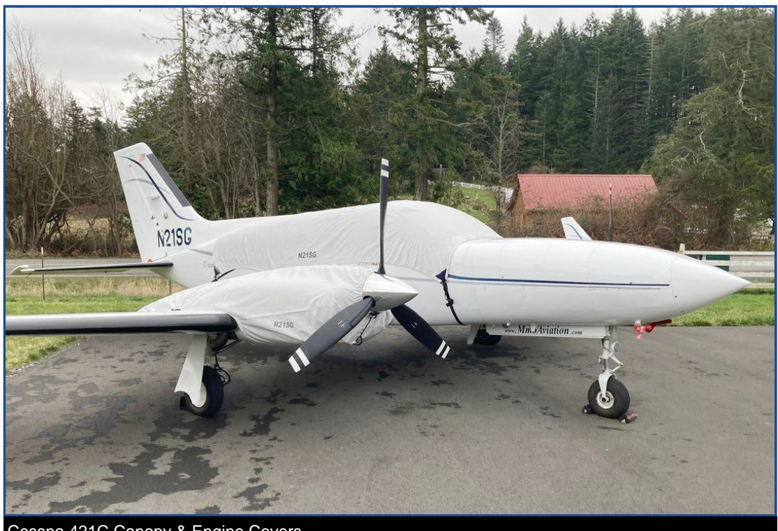
Cessna 421C Canopy & Engine Covers