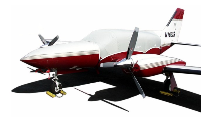
Cessna 421C Canopy Cover & Engine Plugs

Engine Inlet Plugs are custom fit for your Cessna 441, Conquest II intakes, made with heavy-duty vinyl material, and stuffed with a single block of sculpted urethane foam. Each plug has a zipper that allows the foam to be removed and dried if necessary. Engine plugs have warning flags that are visible from the cockpit or 'remove before flight' streamers sewn onto the face of the plugs. Most plugs are imprinted with the aircraft registration number in black for an extra charge. Storage bag NOT included. Engine plugs may be inserted after flight when the engine is still warm. Engine Inlet Plugs are commonly referred to as Cowl Plugs, Intake Plugs, Cowl Blocks, Engine Blocks, and Engine Bungs.