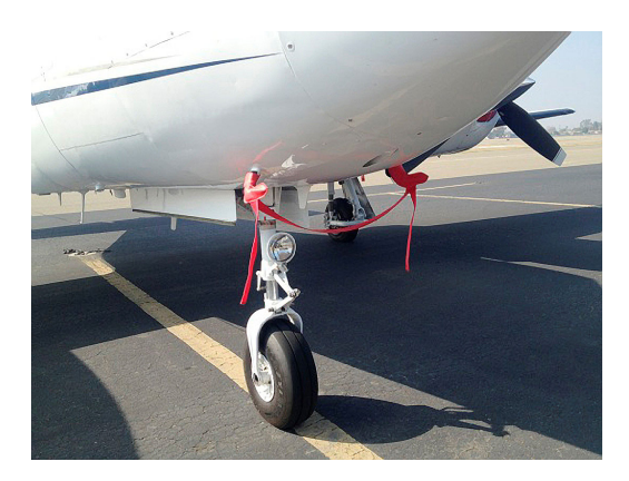
Cessna 421 Pltot Covers set