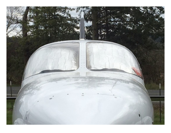
Cessna 421 Windshield HeatShields

Cockpit Heatshields are interior sunshades for the aircraft's cockpit. The product is a unique composite of closed-cell foam with a silver mylar finish. The semi-rigid design is stiff enough to stand inside the window framing. The set folds up flat and is easily stored in the included storage sleeve. Some designs may require velcro and suction cups. A Heatshield is an excellent short-term remedy for cockpit overheating, but an external fabric cover is more effective for long-term protection.