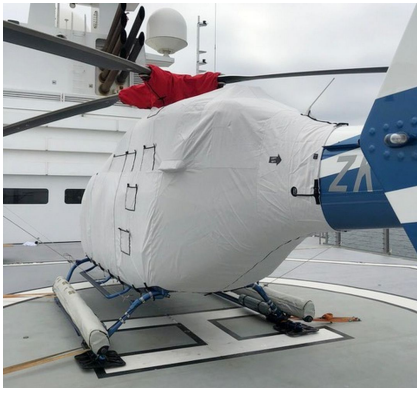
Bell 429 Main Body Cover, Rotor Hub & Tail Rotor Covers