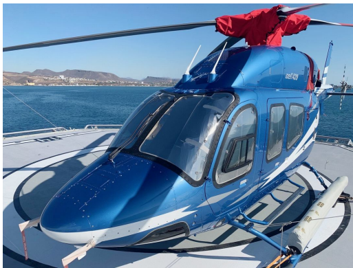
Bell 429 Cockpit & Cabin HeatShields, Rotor Mast/Drive Shafts Cover

Cockpit Heatshields are interior sunshades for the aircraft's cockpit. The product is a unique composite of closed-cell foam with a silver mylar finish. The semi-rigid design is stiff enough to stand inside the window framing. Darts and folds are incorporated into the material so that it conforms to the complex shape of the helicopter windows. The set folds up flat and is easily stored in the included storage sleeve. Some designs may require velcro and suction cups. A Heatshield is an excellent short-term remedy for cockpit overheating, but an external fabric cover is more effective for long-term protection.