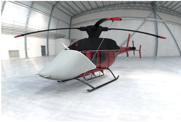
Bell 429 Cockpit/Nose Cover, Engine Cover, etc.