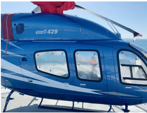
Bell 429 Cockpit & Cabin HeatShields

Cockpit Heatshields are interior sunshades for the aircraft's cockpit. The product is a unique composite of closed-cell foam with a silver mylar finish. The semi-rigid design is stiff enough to stand inside the window framing. Darts and folds are incorporated into the material so that it conforms to the complex shape of the helicopter windows. The set folds up flat and is easily stored in the included storage sleeve. Some designs may require velcro and suction cups. A Heatshield is an excellent short-term remedy for cockpit overheating, but an external fabric cover is more effective for long-term protection.