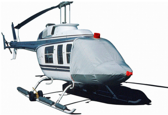
Cockpit Cover on Bell 206L

Travel Covers are made with Silver Solution-Dyed Polyester fabric and fully lined over the entire cover. The material is lightweight and more compact for easy storage in the aircraft. The polyester material is water resistant, but only intended for occasional use outside. We also have an ultra lightweight material available for fitted hangar dust covers. For daily outdoor use, the non-travel Sunbrella Cover is the best choice.