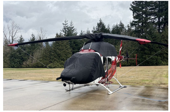
Bell 429 Cold Weather Cover Set