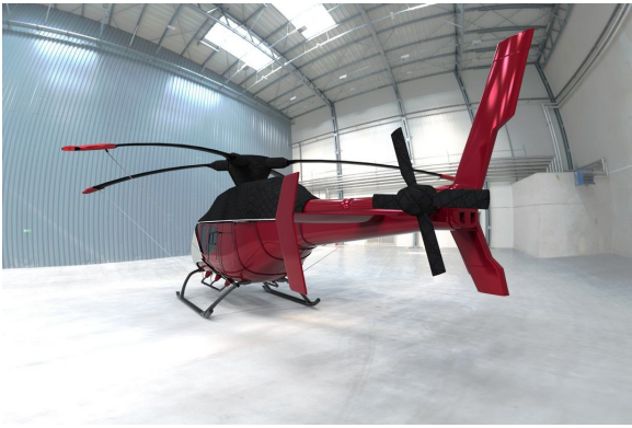
Bell 429 Tail Rotor, Engine, Rotor Hub Covers