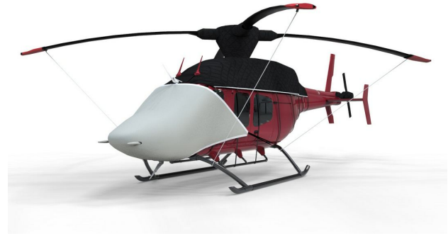
Bell 429 Cockpit/Nose Cover, Engine Cover, etc.