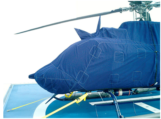
206B/206L/407 Full Body Cover