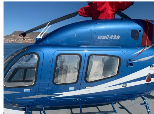
Bell 429 Cockpit & Cabin HeatShields, Rotor Mast/Drive Shafts Cover