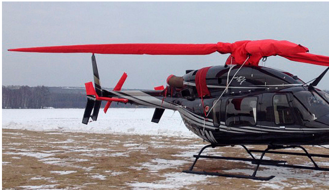
Bell 427 Rotor Blades, Main Rotor Hub/Drive Shafts, Horiz. Stabs, Tail Rotor Covers

WINTER USE MATERIAL - Made with Solution-Dyed Polyester fabric, this option is intended for seasonal use to aid in deicing, rain mitigation, or for occasional travel. The material is lighter and more compact, but more susceptible to UV damage and may have a shorter useful life if used continuously outside than the all-year use material.