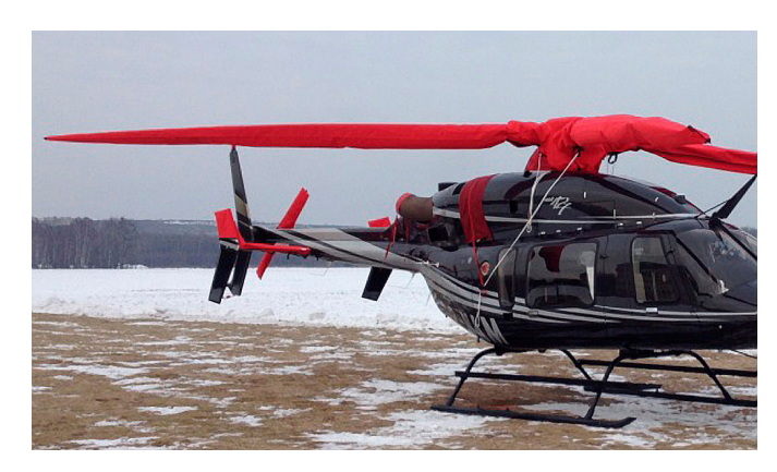
Bell 427 Rotor Blades, Main Rotor Hub/Drive Shafts, Horiz. Stabs, Tail Rotor Covers