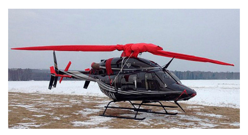
Bell 427 Rotor Blades, Main Rotor Hub/Drive Shafts, Horiz. Stabs, Tail Rotor Covers

WINTER USE MATERIAL - Made with Solution-Dyed Polyester fabric, this option is intended for seasonal use to aid in deicing, rain mitigation, or for occasional travel. The material is lighter and more compact, but more susceptible to UV damage and may have a shorter useful life if used continuously outside than the all-year use material.