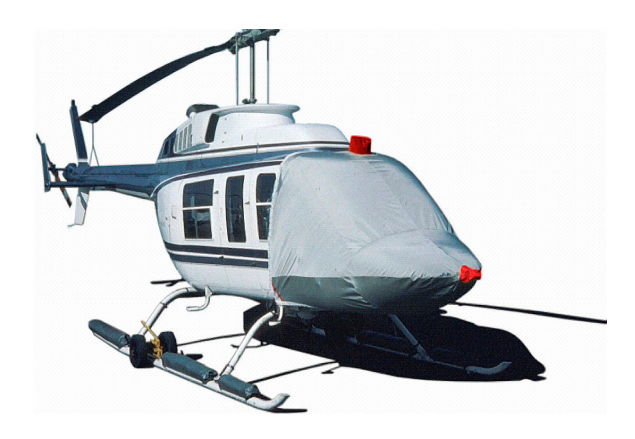
Cockpit Cover on Bell 206L

This cover type is made from Silver Acrylic Sunbrella canvas and is 100% lined with a soft and smooth microfiber. Bruce's Custom Covers developed this material combination especially for aircraft protection. The outer material is medium weight and treated for water resistance, UV resistance and anti-static buildup. The inner lining is a very soft and smooth microfiber to prevent scratching. The material is very reflective, and tests show that the cabin interior temperature can be reduced to near-ambient temperature on the hottest of days. It is water, ice and snow repellent, yet breathable to allow moisture to escape from between the cover and the aircraft surface.