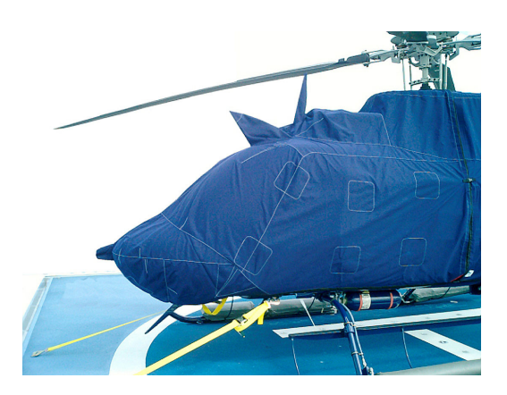
206B/206L/407 Full Body Cover