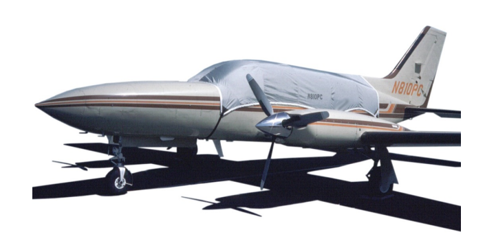
Cessna 421 Cockpit/Windshield Cover