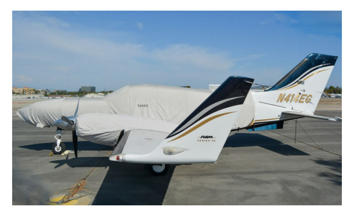
Cessna 340 Insulated Engine Covers