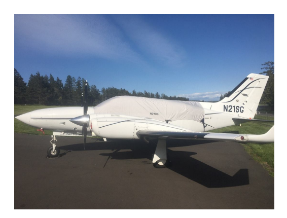
Cessna 421C Canopy Cover