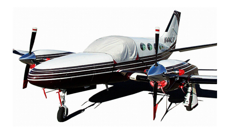
Cessna 425 Cockpit Cover

Travel Covers are made with Silver Solution-Dyed Polyester fabric and only lined over the windshield to save weight. The material is lightweight and more compact for easy stowage in the aircraft. The polyester material is water resistant, but only intended for occasional use outside. We also have an ultra lightweight material available for fitted hangar dust covers. For daily outdoor use, the non-travel Sunbrella Cover is the best choice.