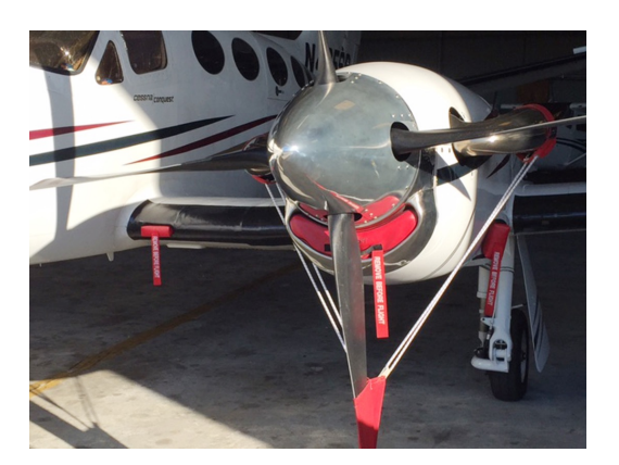
Cessna Conquest I Prop Tie/Exhaust Covers, Engine Plugs

plugs are imprinted with the aircraft registration number in black for an extra charge. Storage bag NOT included. Engine plugs may be inserted after flight when the engine is still warm. Engine Inlet Plugs are commonly referred to as Cowl Plugs, Intake Plugs, Cowl Blocks, Engine Blocks, and Engine Bungs.