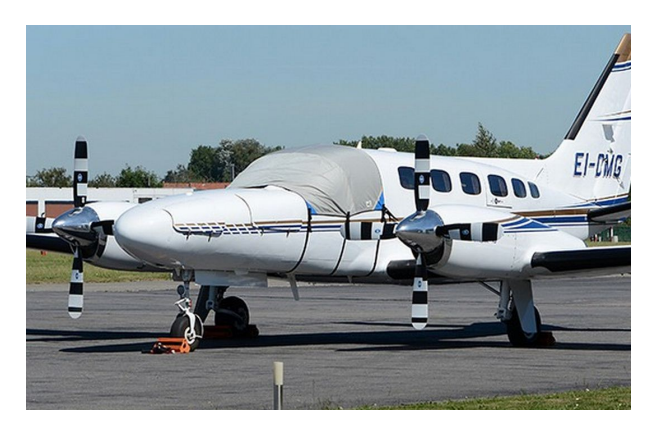
Cessna 441 Cockpit Cover

Covers developed this material combination especially for aircraft protection. The outer material is medium weight and treated for water resistance, UV resistance and anti-static buildup. The inner lining is a very soft and smooth microfiber to prevent scratching. The material is very reflective, and tests show that the cabin interior temperature can be reduced to near-ambient temperature on the hottest of days. It is water, ice and snow repellent, yet breathable to allow moisture to escape from between the cover and the aircraft surface.