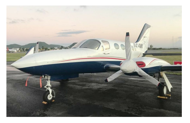
Cessna 414 Propellor/Spinner Covers, 3 Blade

Heatshields are interior sunshades for an aircraft's windows or canopy glass. The product is a unique composite of closed-cell foam with a silver mylar finish. The semi-rigid design is stiff enough to stand along the inside of the windshield using sun visors or window framing. It folds up flat and easily stores in the included storage sleeve. Some designs may require velcro and suction cups. A Heatshield is an excellent short-term remedy for cockpit overheating.