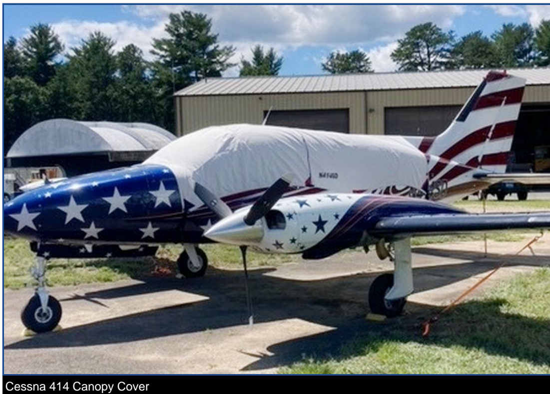
Cessna 414 Canopy Cover