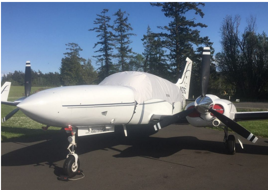
Cessna 421C Canopy Cover

This cover type is made from Silver Acrylic Sunbrella canvas and is 100% lined with a soft and smooth microfiber. Bruce's Custom Covers developed this material combination especially for aircraft protection. The outer material is medium weight and treated for water resistance, UV resistance and anti-static buildup. The inner lining is a very soft and smooth microfiber to prevent scratching. The material is very reflective, and tests show that the cabin interior temperature can be reduced to near-ambient temperature on the hottest of days. It is water, ice and snow repellent, yet breathable to allow moisture to escape from between the cover and the aircraft surface.