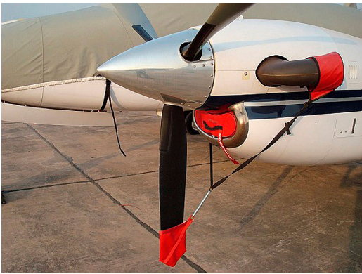
Prop Tie-down/Exhaust Covers