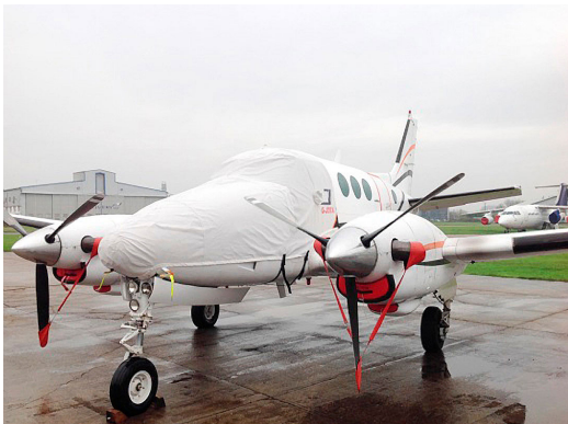
King Air Cockpit/Nose Cover, Plugs, Prop Tie/Exhaust Covers

This cover type is made from Silver Acrylic Sunbrella canvas and is 100% lined with a soft and smooth microfiber. Bruce's Custom Covers developed this material combination especially for aircraft protection. The outer material is medium weight and treated for water resistance, UV resistance and anti-static buildup. The inner lining is a very soft and smooth microfiber to prevent scratching. The material is very reflective, and tests show that the cabin interior temperature can be reduced to near-ambient temperature on the hottest of days. It is water, ice and snow repellent, yet breathable to allow moisture to escape from between the cover and the aircraft surface.