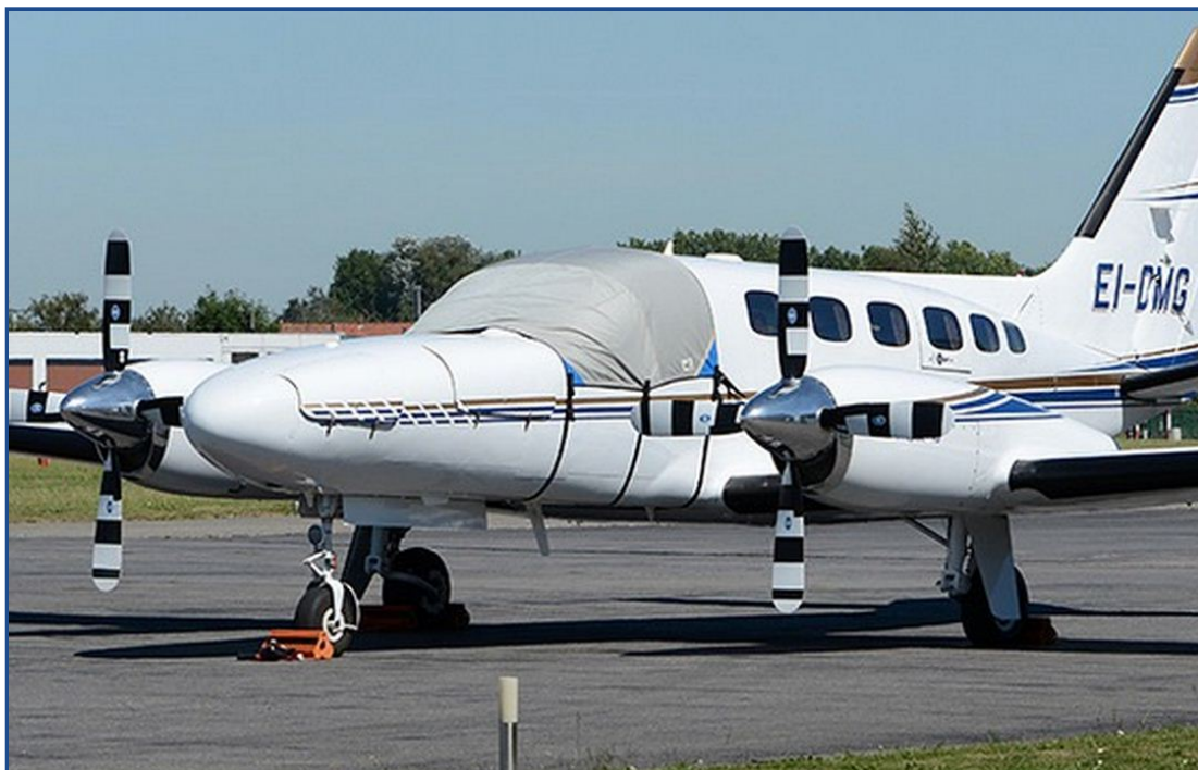
Cessna 441 Cockpit Cover