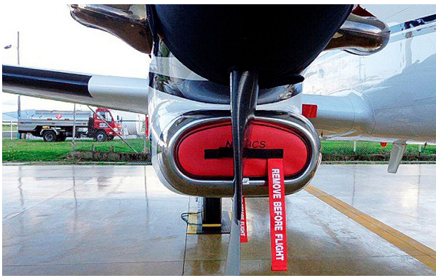
Beech King Air C90B Main Engine Inlet Plug