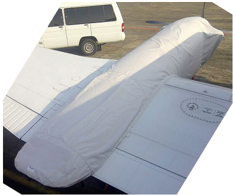
King Air 350 Engine Cover

The material is very reflective, and tests show that the cabin interior temperature can be reduced to near-ambient temperature on the hottest of days. It is water, ice and snow repellent, yet breathable to allow moisture to escape from between the cover and the aircraft surface.