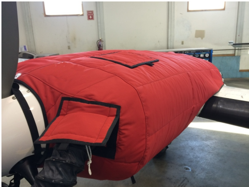
Cessna 402 Insulated Engine Cover with Heater

This cover type is made from Silver Acrylic Sunbrella canvas and is 100% lined with a soft and smooth microfiber. Bruce's Custom Covers developed this material combination especially for aircraft protection. The outer material is medium weight and treated for water resistance, UV resistance and anti-static buildup. The inner lining is a very soft and smooth microfiber to prevent scratching. The material is very reflective, and tests show that the cabin interior temperature can be reduced to near-ambient temperature on the hottest of days. It is water, ice and snow repellent, yet breathable to allow moisture to escape from between the cover and the aircraft surface.