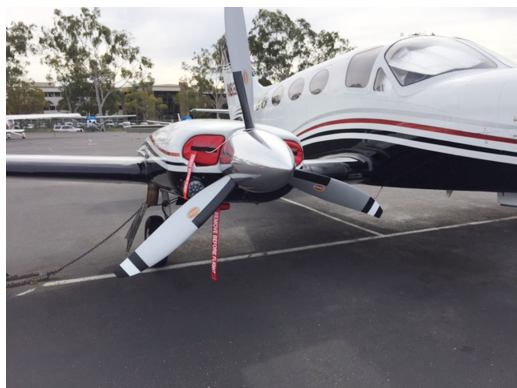
Cessna 414 Engine Inlet Plugs

Engine Inlet Plugs are custom fit for your Cessna 404 Titan, F406 Caravan II intakes, made with heavy-duty vinyl material, and stuffed with a single block of sculpted urethane foam. Each plug has a zipper that allows the foam to be removed and dried if necessary. Engine plugs have warning flags that are visible from the cockpit or 'remove before flight' streamers sewn onto the face of the plugs. Most plugs are imprinted with the aircraft registration number in black for an extra charge. Storage bag NOT included. Engine plugs may be inserted after flight when the engine is still warm. Engine Inlet Plugs are commonly referred to as Cowl Plugs, Intake Plugs, Cowl Blocks, Engine Blocks, and Engine Bungs.