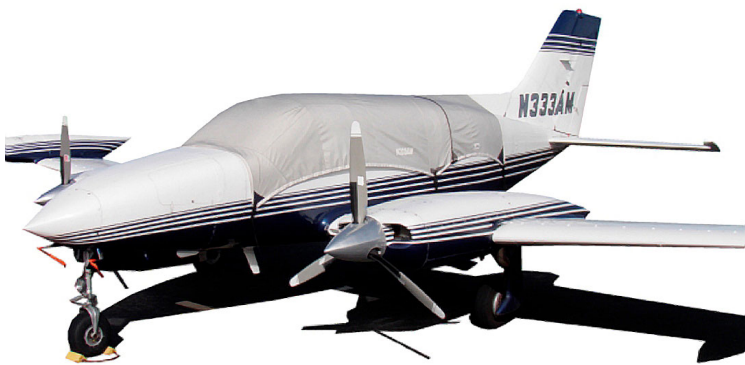
Cessna 414 Canopy Cover & Pitot Covers