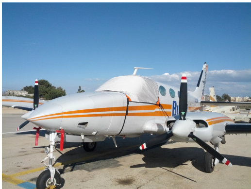
Cessna 340 Cockpit/Windshield Cover

This cover type is made from Silver Acrylic Sunbrella canvas and is 100% lined with a soft and smooth microfiber. Bruce's Custom Covers developed this material combination especially for aircraft protection. The outer material is medium weight and treated for water resistance, UV resistance and anti-static buildup. The inner lining is a very soft and smooth microfiber to prevent scratching. The material is very reflective, and tests show that the cabin interior temperature can be reduced to near-ambient temperature on the hottest of days. It is water, ice and snow repellent, yet breathable to allow moisture to escape from between the cover and the aircraft surface.