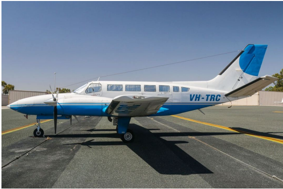
Cessna 404 & F406 HeatShields

foam with a silver mylar finish. The semi-rigid design is stiff enough to stand along the inside of the windshield using sun visors or window framing. It folds up flat and easily stores in the included storage sleeve. Some designs may require velcro and suction cups. A Heatshield is an excellent short-term remedy for cockpit overheating.