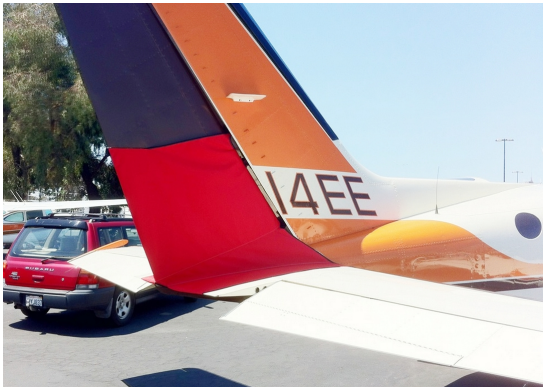
Cessna 414 Rudder Openings Cover (bird barrier)