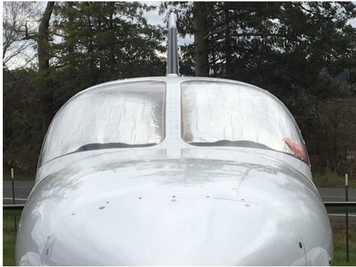
Cessna 421 Windshield HeatShields