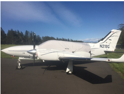
Cessna 421C Canopy Cover