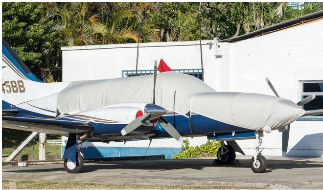
Cessna 421 Canopy Cover & Nose Cover

occasional use outside. We also have an ultra lightweight material available for fitted hangar dust covers. For daily outdoor use, the non-travel Sunbrella Cover is the best choice.