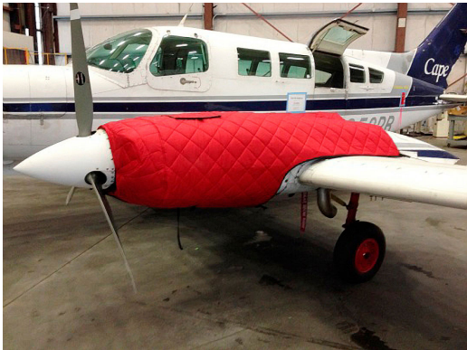
Cessna 402 Insulated Engine Cover