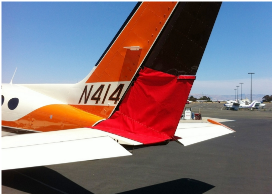
Cessna 414 Rudder Openings Cover (bird barrier)

WINTER USE MATERIAL - Made with Solution-Dyed Polyester fabric, this option is intended for seasonal use to aid in deicing, rain mitigation, or for occasional travel. The material is lighter and more compact, but more susceptible to UV damage and may have a shorter useful life if used continuously outside than the all-year use material.