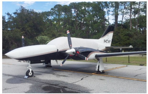
Cessna 421 Canopy Cover, Engine Plugs