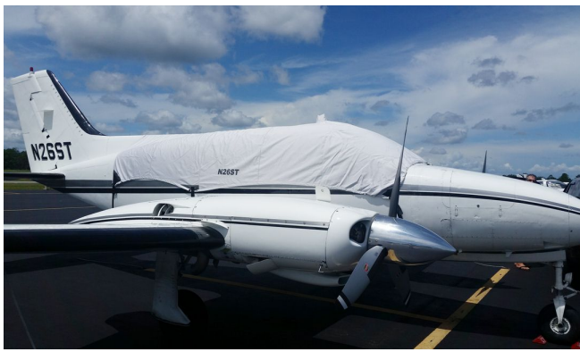
Cessna 414 Canopy Cover