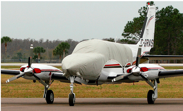
Cessna 340 Canopy/Nose Cover & Engine Inlet Plugs