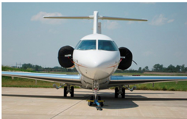
Hawker 4000 Intake Covers

The Hawker Beechcraft 4000 Horizon Intake Covers are designed to install easily yet be completely storable. A spring steel hoop is sewn into the hem of each cover, allowing them to be installed without climbing onto the wing or using a stepladder. To store the covers the spring steel hoop folds like a band-saw blade into three nesting rings. Each cover folds into a compact circular bundle which is stored in the included duffle bag, yet they unfold quickly for use. The Tri-Fold Ring cover is made of medium weight nylon which is available in a variety of colors to match the paint trim. Each cover set comes complete with installation and folding instructions. The aircraft's registration number can be silkscreened onto the cover for an extra charge.