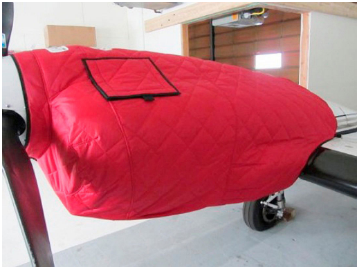
Cessna 421 Insulated Engine Covers