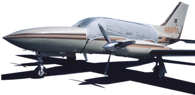
Cessna 421 Cockpit/Windshield Cover

This cover type is made from Silver Acrylic Sunbrella canvas and is 100% lined with a soft and smooth microfiber. Bruce's Custom Covers developed this material combination especially for aircraft protection. The outer material is medium weight and treated for water resistance, UV resistance and anti-static buildup. The inner lining is a very soft and smooth microfiber to prevent scratching. The material is very reflective, and tests show that the cabin interior temperature can be reduced to near-ambient temperature on the hottest of days. It is water, ice and snow repellent, yet breathable to allow moisture to escape from between the cover and the aircraft surface.