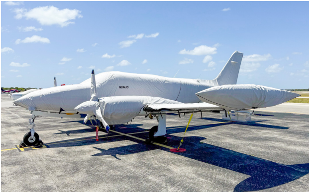
Cessna 340 Complete Cover Set