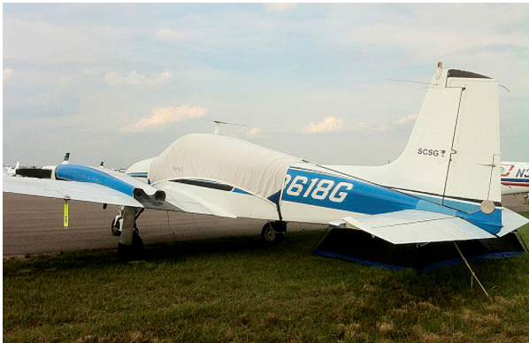
Cessna 320 Canopy Cover

Travel Covers are made with Silver Solution-Dyed Polyester fabric and only lined over the windshield to save weight. The material is lightweight and more compact for easy stowage in the aircraft. The polyester material is water resistant, but only intended for occasional use outside. We also have an ultra lightweight material available for fitted hangar dust covers. For daily outdoor use, the non-travel Sunbrella Cover is the best choice.