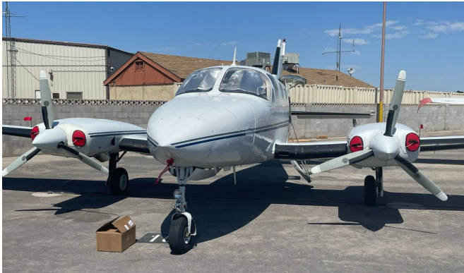
Cessna 414 Engine Inlet Plugs

Engine Inlet Plugs are custom fit for your Cessna 335, 340 intakes, made with heavy-duty vinyl material, and stuffed with a single block of sculpted urethane foam. Each plug has a zipper that allows the foam to be removed and dried if necessary. Engine plugs have warning flags that are visible from the cockpit or 'remove before flight' streamers sewn onto the face of the plugs. Most plugs are imprinted with the aircraft registration number in black for an extra charge. Storage bag NOT included. Engine plugs may be inserted after flight when the engine is still warm. Engine Inlet Plugs are commonly referred to as Cowl Plugs, Intake Plugs, Cowl Blocks, Engine Blocks, and Engine Bungs.