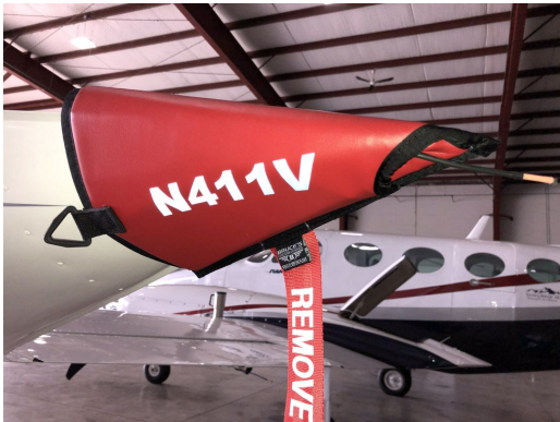
Cessna 335, 340 Wingtip Pads

Designed to prevent damage to the aircraft extremities in crowded hangars, these products are made of bright red Naugahyde and thickly padded with a sandwich of closed cell foam.