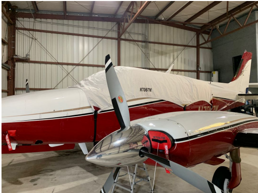
Cessna 340A Canopy Cover