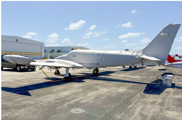
Cessna 340 Complete Cover Set