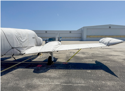
Cessna 340 Complete Cover Set

WINTER USE MATERIAL - Made with Solution-Dyed Polyester fabric, this option is intended for seasonal use to aid in deicing, rain mitigation, or for occasional travel. The material is lighter and more compact, but more susceptible to UV damage and may have a shorter useful life if used continuously outside than the all-year use material.