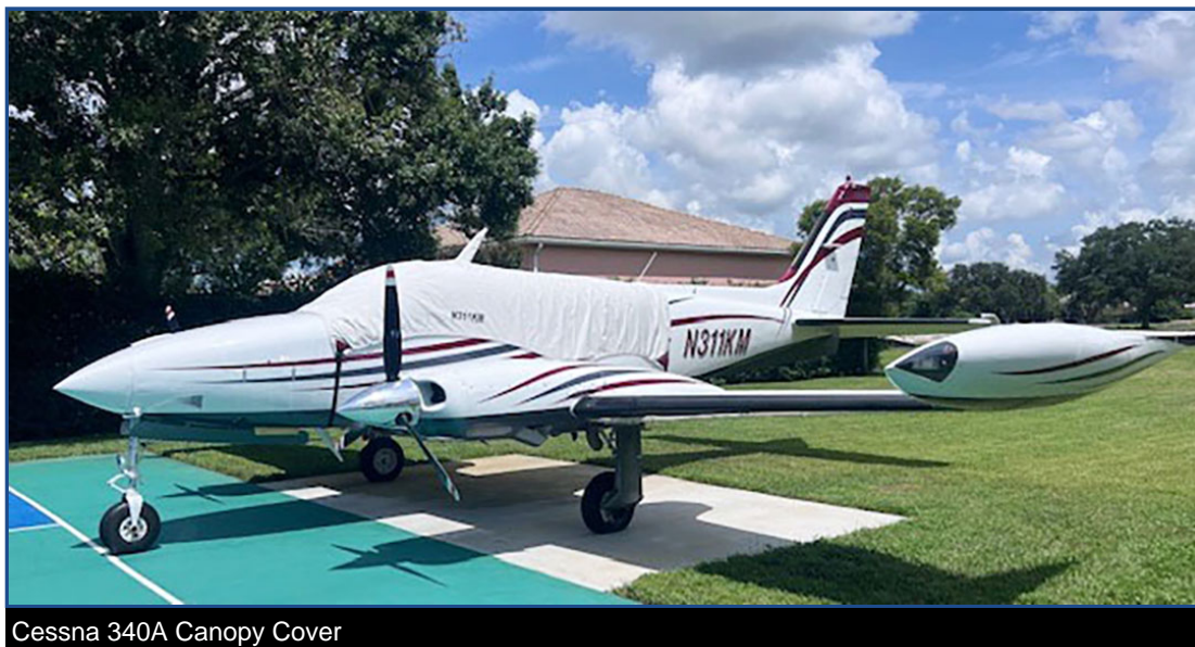
Cessna 340A Canopy Cover