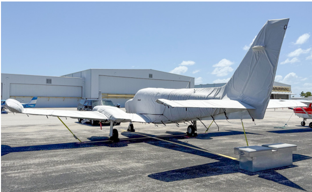
Cessna 340 Complete Cover Set

This cover type is made from Silver Acrylic Sunbrella canvas and is 100% lined with a soft and smooth microfiber. Bruce's Custom Covers developed this material combination especially for aircraft protection. The outer material is medium weight and treated for water resistance, UV resistance and anti-static buildup. The inner lining is a very soft and smooth microfiber to prevent scratching. The material is very reflective, and tests show that the cabin interior temperature can be reduced to near-ambient temperature on the hottest of days. It is water, ice and snow repellent, yet breathable to allow moisture to escape from between the cover and the aircraft surface.