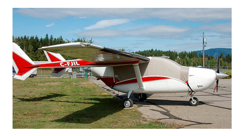
Cessna 337 Skymaster Canopy Cover w/ 14" bib ext.

This cover type is made from Silver Acrylic Sunbrella canvas and is 100% lined with a soft and smooth microfiber. Bruce's Custom Covers developed this material combination especially for aircraft protection. The outer material is medium weight and treated for water resistance, UV resistance and anti-static buildup. The inner lining is a very soft and smooth microfiber to prevent scratching. The material is very reflective, and tests show that the cabin interior temperature can be reduced to near-ambient temperature on the hottest of days. It is water, ice and snow repellent, yet breathable to allow moisture to escape from between the cover and the aircraft surface.