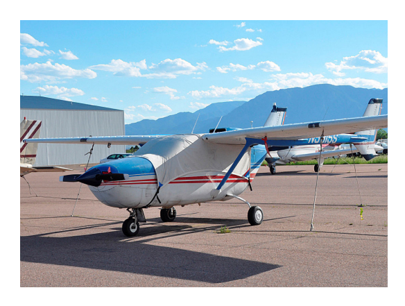
Cessna 337 Skymaster Canopy Cover, Forward Engine Plugs and Pitot Cover