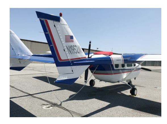
Cessna Skymaster 337G Rear Engine Inlet Cover