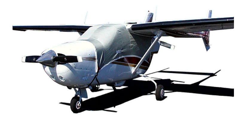
Cessna Skymaster Canopy Cover w/ 14" bib ext.