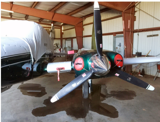
Cessna 310 Engine and Center Section Plugs

Engine Inlet Plugs are custom fit for your Cessna 320 intakes, made with heavy-duty vinyl material, and stuffed with a single block of sculpted urethane foam. Each plug has a zipper that allows the foam to be removed and dried if necessary. Engine plugs have warning flags that are visible from the cockpit or 'remove before flight' streamers sewn onto the face of the plugs. Most plugs are imprinted with the aircraft registration number in black for an extra charge. Storage bag NOT included. Engine plugs may be inserted after flight when the engine is still warm. Engine Inlet Plugs are commonly referred to as Cowl Plugs, Intake Plugs, Cowl Blocks, Engine Blocks, and Engine Bungs.