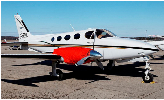
Cessna 340 Insulated Engine Covers