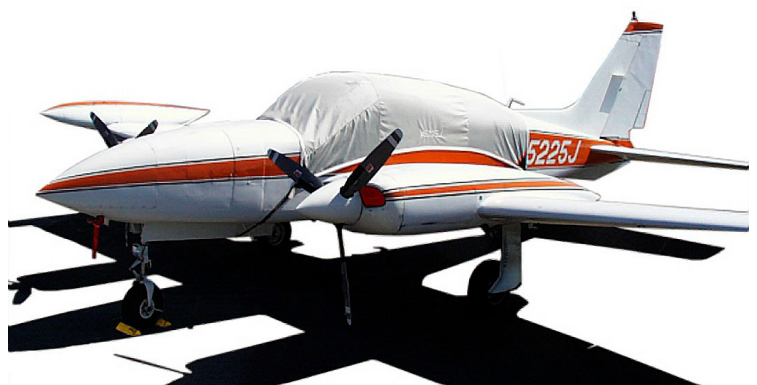
Cessna 310Q Canopy Cover