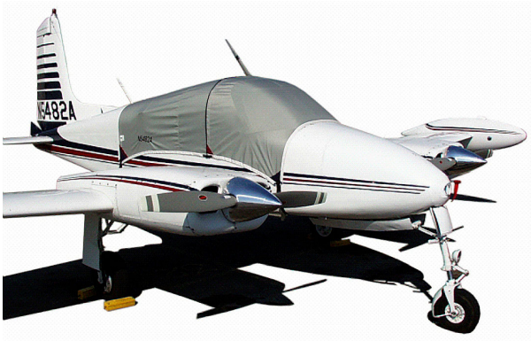
Cessna 310A Canopy Cover