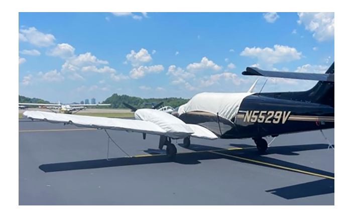
Cessna T303 Crusader Canopy Cover