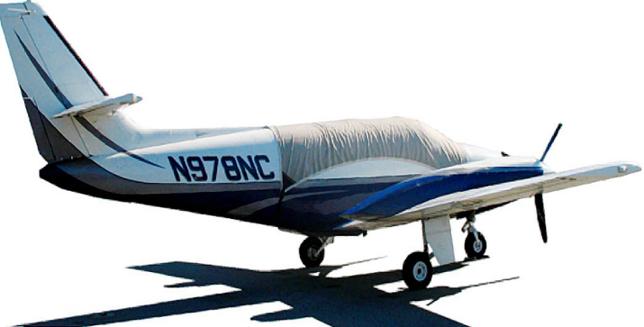
Cessna Crusader Standard Canopy Cover