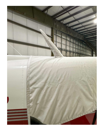
Cessna T303 Canopy Cover