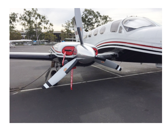
Cessna 414 Engine Inlet Plugs

Engine Inlet Plugs are custom fit for your Cessna T303 Crusader intakes, made with heavy-duty vinyl material, and stuffed with a single block of sculpted urethane foam. Each plug has a zipper that allows the foam to be removed and dried if necessary. Engine plugs have warning flags that are visible from the cockpit or 'remove before flight' streamers sewn onto the face of the plugs. Most plugs are imprinted with the aircraft registration number in black for an extra charge. Storage bag NOT included. Engine plugs may be inserted after flight when the engine is still warm. Engine Inlet Plugs are commonly referred to as Cowl Plugs, Intake Plugs, Cowl Blocks, Engine Blocks, and Engine Bungs.