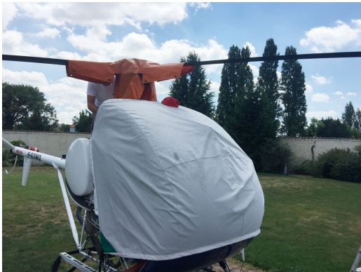
Hughes/Schweizer 300C Bubble Cover & Rotor Hub Cover

WINTER USE MATERIAL - Made with Solution-Dyed Polyester fabric, this option is intended for seasonal use to aid in deicing, rain mitigation, or for occasional travel. The material is lighter and more compact, but more susceptible to UV damage and may have a shorter useful life if used continuously outside than the all-year use material.