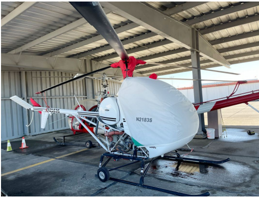
Schweizer 300C Bubble, Main & Tail Rotor Covers