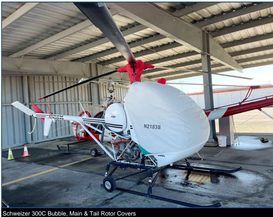
Schweizer 300C Bubble, Main &amp; Tail Rotor Covers