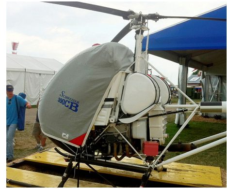
Schweizer 300CB Bubble Cover