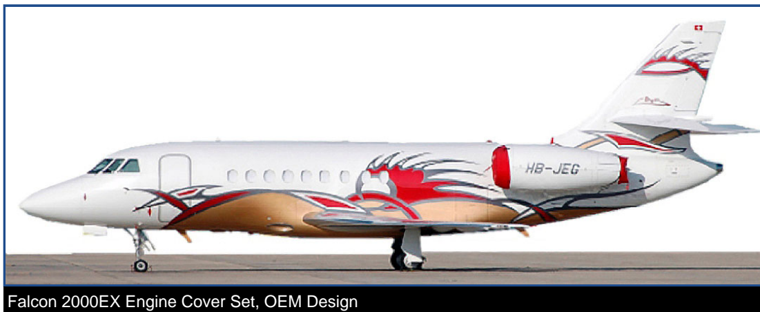
Falcon 2000EX Engine Cover Set, OEM Design