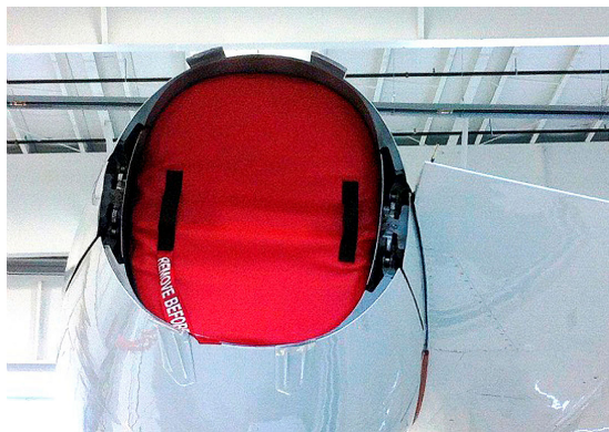
Falcon 2000EX Exhaust Plug

The Engine Inlet Plugs are custom fit for your Falcon Jet 2000EX, 2000LXS intakes, made with heavy-duty vinyl material, and stuffed with a single block of sculpted urethane foam. Each plug has a zipper that allows the foam to be removed and dried if necessary. Engine plugs have 'remove before flight' streamers sewn onto the face of the plugs. Most plugs are imprinted with the aircraft registration number in black for an extra charge. Storage bag NOT included. Engine plugs may be inserted after flight when the engine is still warm. Engine Inlet Plugs are commonly referred to as Cowl Plugs, Intake Plugs, Cowl Blocks, Engine Blocks, and Engine Bungs.