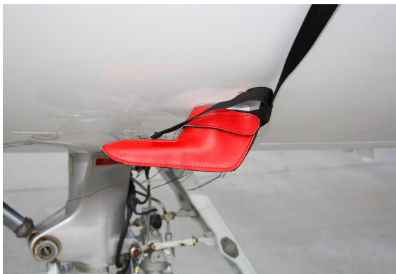
Falcon Jet 2000EX, 2000LXS Pitot Covers, Aoa's, Tat Cover Set, Heat Resistant Type