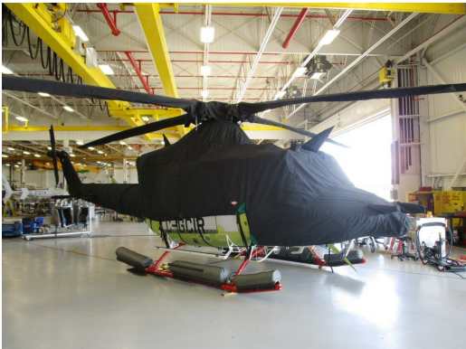
Bell 412 Cockpit/Canopy/Nose, Insulated Engine Area, Rotor Hub, Blade, Tailboom and Tail Rotor Covers