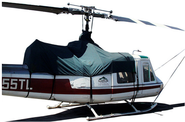
Bell 204/205 Engine/Mid-Cabin Cover

WINTER USE MATERIAL - Made with Solution-Dyed Polyester fabric, this option is intended for seasonal use to aid in deicing, rain mitigation, or for occasional travel. The material is lighter and more compact, but more susceptible to UV damage and may have a shorter useful life if used continuously outside than the all-year use material.