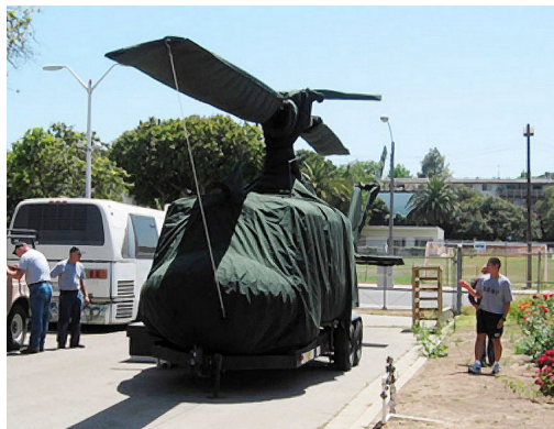
Bell 204/205 Full Body Cover Set

This cover type is made from Silver Acrylic Sunbrella canvas and is 100% lined with a soft and smooth microfiber. Bruce's Custom Covers developed this material combination especially for aircraft protection. The outer material is medium weight and treated for water resistance, UV resistance and anti-static buildup. The inner lining is a very soft and smooth microfiber to prevent scratching. The material is very reflective, and tests show that the cabin interior temperature can be reduced to near-ambient temperature on the hottest of days. It is water, ice and snow repellent, yet breathable to allow moisture to escape from between the cover and the aircraft surface.