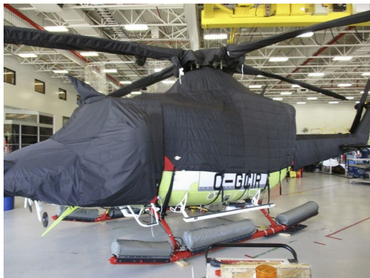
Bell 412 Cockpit/Canopy/Nose, Insulated Engine Area, Rotor Hub, Blade, Tailboom and Tail Rotor Coversroto