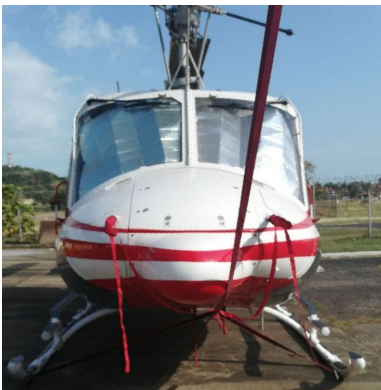
Bell 212 Windshield HeatShields

Cockpit Heatshields are interior sunshades for the aircraft's cockpit. The product is a unique composite of closed-cell foam with a silver mylar finish. The semi-rigid design is stiff enough to stand inside the window framing. Darts and folds are incorporated into the material so that it conforms to the complex shape of the helicopter windows. The set folds up flat and is easily stored in the included storage sleeve. Some designs may require velcro and suction cups. A Heatshield is an excellent short-term remedy for cockpit overheating, but an external fabric cover is more effective for long-term protection.