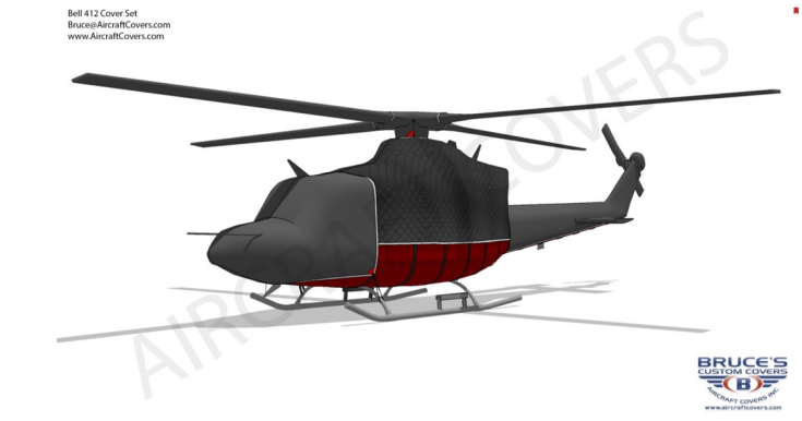
Bell 412 Forward Cabin/Nose, Insulated Engine, Tailboom, Rotor Hub & Blade Covers

available separately. Specific information for each model is available on request.