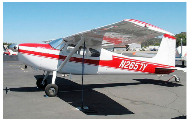
Cessna 180 & 185 Windshield HeatShield