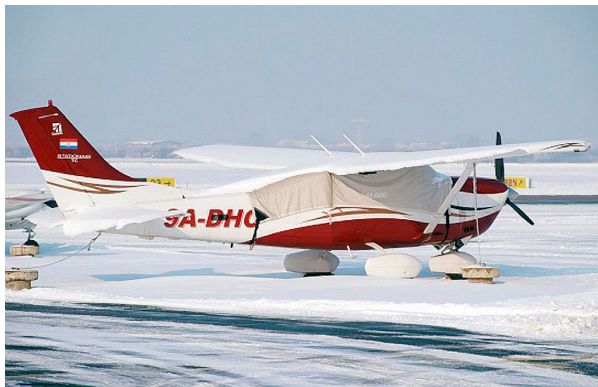
Cessna 206 Wrap-Around Canopy Cover

This cover type is made from Silver Acrylic Sunbrella canvas and is 100% lined with a soft and smooth microfiber. Bruce's Custom Covers developed this material combination especially for aircraft protection. The outer material is medium weight and treated for water resistance, UV resistance and anti-static buildup. The inner lining is a very soft and smooth microfiber to prevent scratching. The material is very reflective, and tests show that the cabin interior temperature can be reduced to near-ambient temperature on the hottest of days. It is water, ice and snow repellent, yet breathable to allow moisture to escape from between the cover and the aircraft surface.