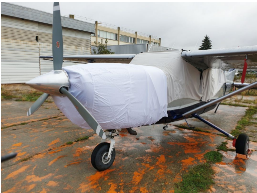
Cessna 207 Engine Cover (test fit)