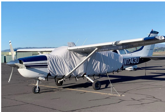
Cessna T207 Extended Canopy Cover