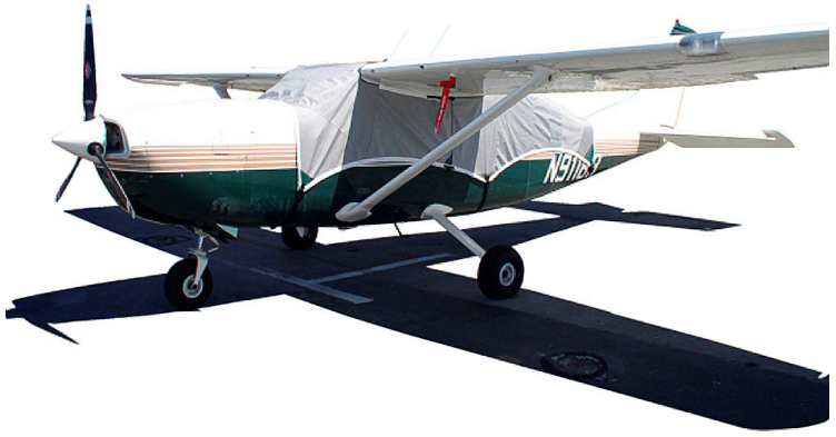
Cessna 207 Canopy Cover