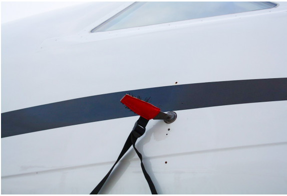
Falcon Jet 2000 Pitot Covers, Aoa's, Tat Cover Set, Heat Resistant Type