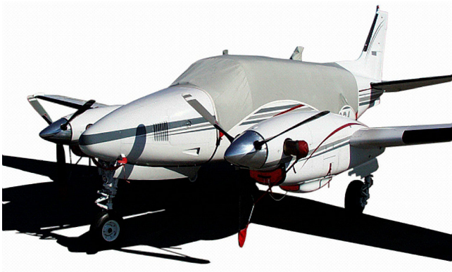
King Air Canopy Cover, Engine Plugs, Prop-Tie/Exhaust Covers