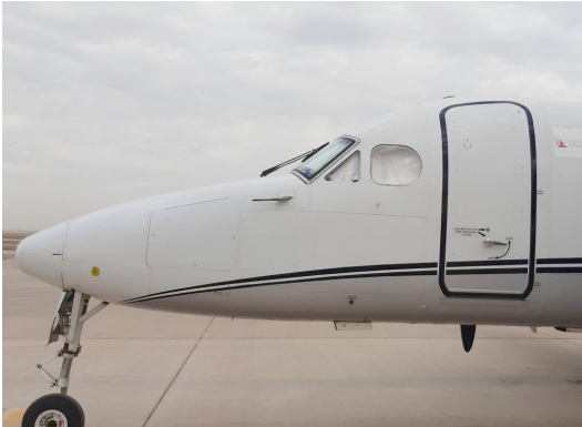
Raytheon 1900D Cockpit HeatShields