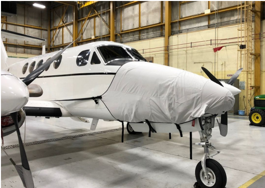
King Air 200 Nose Cover

The Beech 1900C Nose Cover is designed to cover the section of the fuselage forward of the windshield to the tip of the nose. It is secured with belly strapsThis cover type is made from Silver Acrylic Sunbrella canvas and is 100% lined with a soft and smooth microfiber. Bruce's Custom Covers developed this material combination especially for aircraft protection. The outer material is medium weight and treated for water resistance, UV resistance and anti-static buildup. The inner lining is a very soft and smooth microfiber to prevent scratching. The material is very reflective, and tests show that the cabin interior temperature can be reduced to near-ambient temperature on the hottest of days. It is water, ice and snow repellent, yet breathable to allow moisture to escape from between the cover and the aircraft surface.