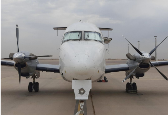
Raytheon 1900D Cockpit HeatShields

Cockpit Heatshields are interior sunshades for the aircraft's cockpit. The product is a unique composite of closed-cell foam with a silver mylar finish. The semi-rigid design is stiff enough to stand inside the window framing. The set folds up flat and is easily stored in the included storage sleeve. Some designs may require velcro and suction cups. A Heatshield is an excellent short-term remedy for cockpit overheating, but an external fabric cover is more effective for long-term protection.