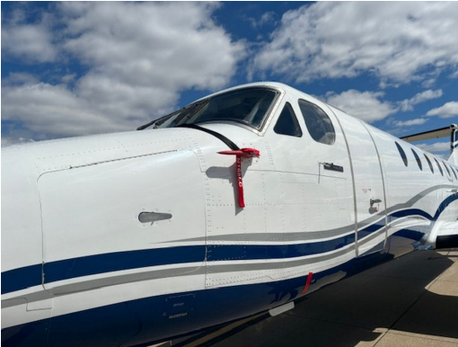
Beech 1900C PITOT COVERS

Engine Inlet Plugs are custom fit for your Beech 1900C intakes, made with heavy-duty vinyl material, and stuffed with a single block of sculpted urethane foam. Each plug has a zipper that allows the foam to be removed and dried if necessary. Engine plugs have warning flags that are visible from the cockpit or 'remove before flight' streamers sewn onto the face of the plugs. Most plugs are imprinted with the aircraft registration number in black for an extra charge. Storage bag NOT included. Engine plugs may be inserted after flight when the engine is still warm. Engine Inlet Plugs are commonly referred to as Cowl Plugs, Intake Plugs, Cowl Blocks, Engine Blocks, and Engine Bungs.