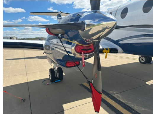
Beech 1900C Engine Inlet & Oil Cooler Plugs, Prop Tie/Exhaust Covers