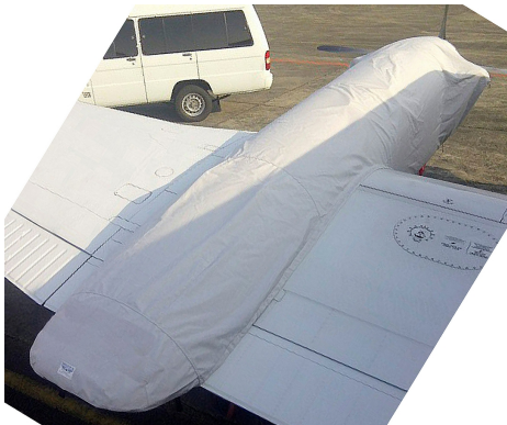
King Air 350 Engine Cover

This cover type is made from Silver Acrylic Sunbrella canvas and is 100% lined with a soft and smooth microfiber. Bruce's Custom Covers developed this material combination especially for aircraft protection. The outer material is medium weight and treated for water resistance, UV resistance and anti-static buildup. The inner lining is a very soft and smooth microfiber to prevent scratching. The material is very reflective, and tests show that the cabin interior temperature can be reduced to near-ambient temperature on the hottest of days. It is water, ice and snow repellent, yet breathable to allow moisture to escape from between the cover and the aircraft surface.