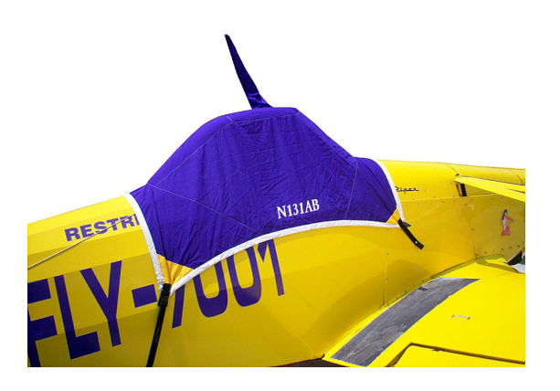
Piper Pawnee Canopy Cover