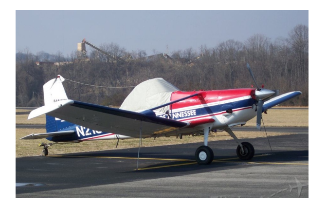
Cessna 188 Ag Truck Canopy Cover