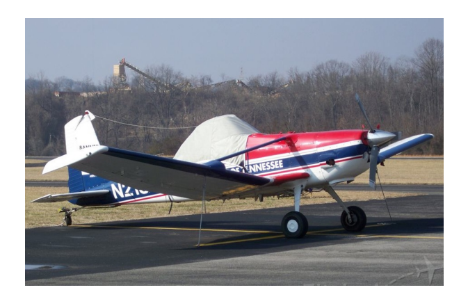
Cessna 188 Ag Truck Canopy Cover

Travel Covers are made with Silver Solution-Dyed Polyester fabric and only lined over the windshield to save weight. The material is lightweight and more compact for easy stowage in the aircraft. The polyester material is water resistant, but only intended for occasional use outside. We also have an ultra lightweight material available for fitted hangar dust covers. For daily outdoor use, the non-travel Sunbrella Cover is the best choice.