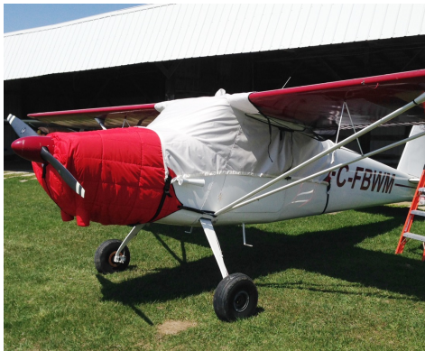
Cessna 170 Over-Top Canopy Cover, Insulated Engine Cover