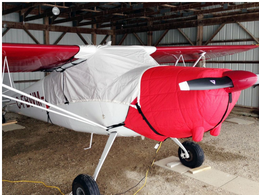
Cessna 170 Insulated Engine Cover

This cover type is made from Silver Acrylic Sunbrella canvas and is 100% lined with a soft and smooth microfiber. Bruce's Custom Covers developed this material combination especially for aircraft protection. The outer material is medium weight and treated for water resistance, UV resistance and anti-static buildup. The inner lining is a very soft and smooth microfiber to prevent scratching. The material is very reflective, and tests show that the cabin interior temperature can be reduced to near-ambient temperature on the hottest of days. It is water, ice and snow repellent, yet breathable to allow moisture to escape from between the cover and the aircraft surface.