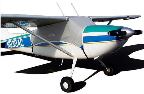
Cessna 180 Canopy Cover

This cover type is made from Silver Acrylic Sunbrella canvas and is 100% lined with a soft and smooth microfiber. Bruce's Custom Covers developed this material combination especially for aircraft protection. The outer material is medium weight and treated for water resistance, UV resistance and anti-static buildup. The inner lining is a very soft and smooth microfiber to prevent scratching. The material is very reflective, and tests show that the cabin interior temperature can be reduced to near-ambient temperature on the hottest of days. It is water, ice and snow repellent, yet breathable to allow moisture to escape from between the cover and the aircraft surface.