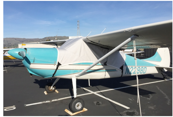
Cessna 170 Over-Top Canopy Cover