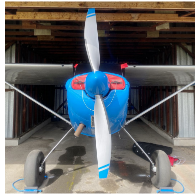
Custom Plugs for Cessna 170 with 180HP Lycoming O-360 Engine