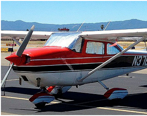
Cessna 172 Cabin HeatShields