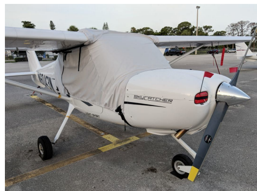
Cessna Skycatcher 162 Canopy Cover and Engine Inlet Plugs