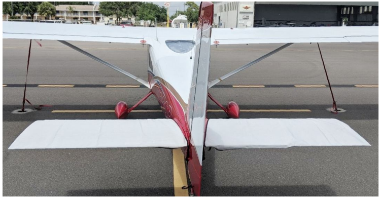
Cessna 162 Skycatcher Horizontal Stabilizer Covers