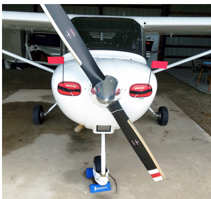
Cessna Skycatcher 162 Engine Inlet Plugs

Engine Inlet Plugs are custom fit for your Cessna Skycatcher 162 intakes, made with heavy-duty vinyl material, and stuffed with a single block of sculpted urethane foam. Each plug has a zipper that allows the foam to be removed and dried if necessary. Engine plugs have warning flags that are visible from the cockpit or 'remove before flight' streamers sewn onto the face of the plugs. Most plugs are imprinted with the aircraft registration number in black for an extra charge. Storage bag NOT included. Engine plugs may be inserted after flight when the engine is still warm. Engine Inlet Plugs are commonly referred to as Cowl Plugs, Intake Plugs, Cowl Blocks, Engine Blocks, and Engine Bunges.