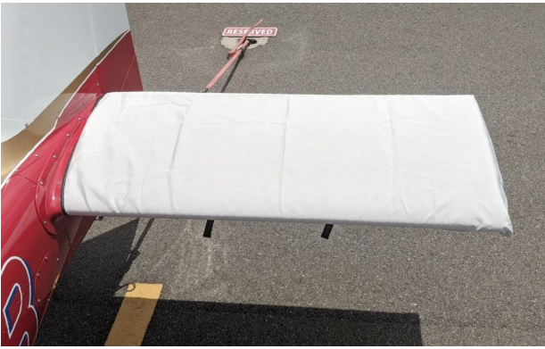
Cessna 162 Skycatcher Horizontal Stabilizer Covers