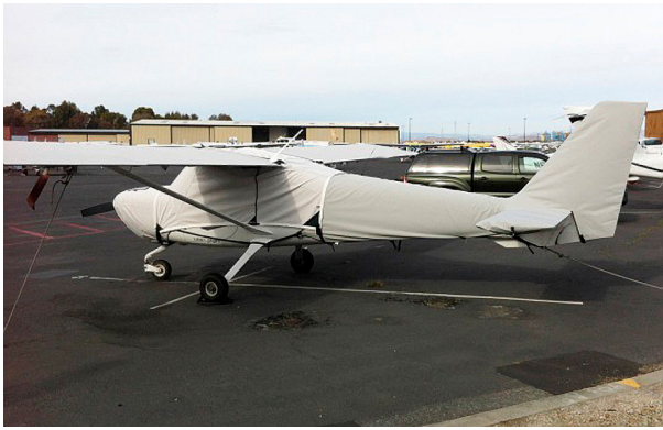
Cessna Skycatcher Full Cover Set