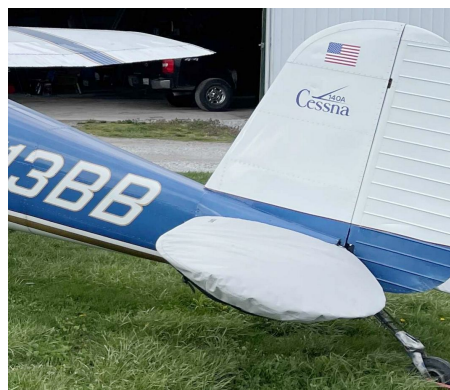
Cessna 140 Horizontal Stabilizer Covers