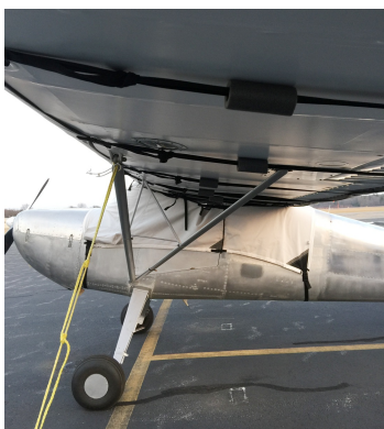
Cessna 140 Canopy Cover, Wing Covers