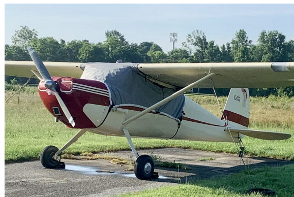
Cessna 140 Travel Weight Canopy Cover