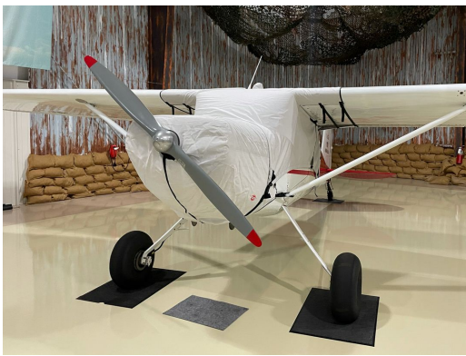
Cessna 140 Canopy Cover, Over Top Type, (140a Models, Covers Gas Caps)