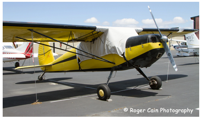
Cessna 140 Over-The-Top Style Canopy Cover