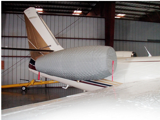
IAI Westwind Insulated Engine Nacelle Cover

instructions. The aircraft's registration number can be silkscreened onto the cover for an extra charge.