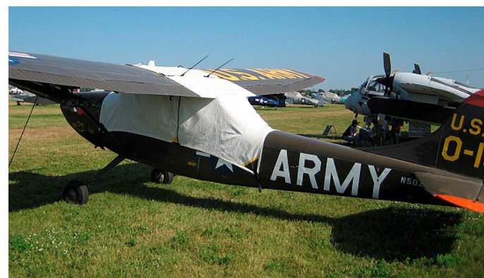
L-19 Canopy Cover (similar to Siai Marchetti 1019)

This cover type is made from Silver Acrylic Sunbrella canvas and is 100% lined with a soft and smooth microfiber. Bruce's Custom Covers developed this material combination especially for aircraft protection. The outer material is medium weight and treated for water resistance, UV resistance and anti-static buildup. The inner lining is a very soft and smooth microfiber to prevent scratching. The material is very reflective, and tests show that the cabin interior temperature can be reduced to near-ambient temperature on the hottest of days. It is water, ice and snow repellent, yet breathable to allow moisture to escape from between the cover and the aircraft surface.