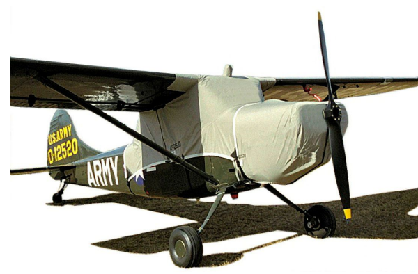
Cessna L-19 Canopy & Engine Covers (similar to Siai Marchetti 1019)