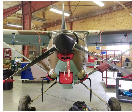
Siai Marchetti 1019 Engine Plugs, Prop Tie-Exhaust Covers